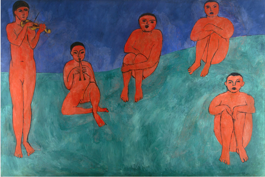
Figure 3: Henri Matisse, La Musique , 1910; The Hermitage, St. Petersburg. © Succession H. Matisse/Copyright Agency, 2022. https://www.hermitagemuseum.org/wps/portal/hermitage/digital-collection/01.+paintings/28424

carved out of limestone at a height of about 43 centimetres, a width of 20 centimetres, and a depth of 26. With smooth shoulder-length hair (presumably a wig) tucked behind relatively large ears, this adult male squats on the ground, knees drawn up in front of the chest, arms crossed and placed over them. His body is largely covered by a cloak, so that most of the detail is reserved for the face: rounded eyes with what looks like prominent liner on the upper lids, ridge-like eyebrows, a broad nose, wide mouth, and pursed, gently upturned lips. Feet are also prominent, flat on the ground with long toes splayed forwards. The overall impression is of a compact, weighty body, a “closed” physical form, yet one with a non-intimidating appearance.