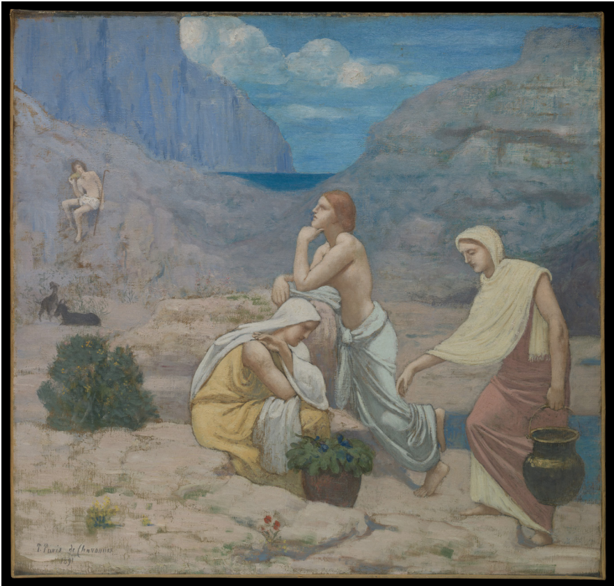
Figure 1: Pierre Puvis de Chavannes, Le Chant du berger , 1891; Metropolitan Museum of Art, New York City. https://www.metmuseum.org/art/collection/search/437344

Beaux-Arts in his hometown of Lyon. While he is relatively little known today, at least among the general populace, Puvis was a leading figure of his time, recognized mainly for his public art: grand-format classicizing commissions for Lyon, Paris (the Panthéon, the Sorbonne, and the Hôtel de Ville, among others), Amiens, Rouen, Poitiers, and even Boston (the Public Library). Indeed, such was Puvis's popularity that his paintings were applauded by a cross-section of polite society: conservative critics, the avant-garde, royalists, Republicans, and radicals. To the French left-wing leader Jean Jaurès (1900), for example, Puvis inaugurated democratic socialism; Marius-Ary Leblond, the pseudonym of a pair of cousins from the French colony of Réunion, extended the analogy, considering Puvis's work the epitome of "the happiness of communist life" (Leblond 1905, xiii–xiv). In stark contrast, the nationalist author and politician Charles Maurras (1895) understood the painter to signify an originary Frenchness, an ideal of enracinement that helped counter a prevailing foreign influence in fin-de-siècle art and culture by reference to the purification of a classical spirit and the dignity of the ancients.