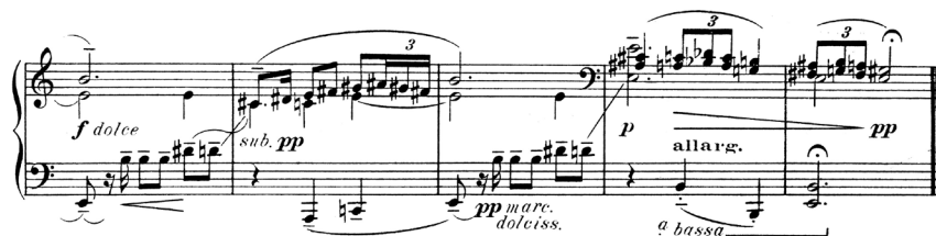
Example 7: Richness of scalar ambiguity at the end of the final Mazurka, op. 62, no. 2, mm. 80–84. With the kind authorization of Editions Durand.

Szymanowski troubled himself a great deal over this final cadence and produced an unusually large number of sketches for it. 41 It is appropriate that his final solution would prove to be the richest of all them in its harmonic innuendo, and particularly in its shifting between major and minor thirds.