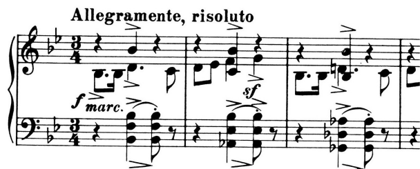
Example 1a. Free parallel fifths from the Mazurka op. 50, no. 4, mm. 1–3. Karol Szymanowski “Mazurkas | für Klavier | op. 50”. © Copyright 1926 by Universal Edition A.G., Wien. www.universaledition.com