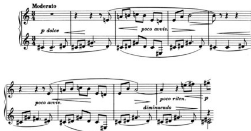
Example 6. A candidate for bitonal analysis: Mazurka op. 50, no. 3, mm. 1–10. Karol Szymanowski “Mazurkas | für Klavier | op. 50”. © Copyright 1926 by Universal Edition A.G., Wien. www.universaledition.com