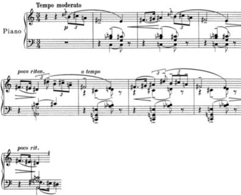
Example 5: A complex problem of locating a key centre: Mazurka op. 50, no. 9, mm. 1–9. Karol Szymanowski “Mazurkas | für Klavier | op. 50”. © Copyright 1926 by Universal Edition A.G., Wien. www.universaledition.com

A key centre in the common-practice period is established by an overall system of tonality. Elements of this system include a referential tonic triad, a system of functional harmonic progressions, and a set of voice leading principles that pull leading tones up to tonics and fourth scale degrees down to thirds. These characteristic features are substantially weakened in the mazurkas. The third scale degree in the tonic triad is often missing or ambiguous (as in the G/G# dichotomy in example 3). Traditional voice-leading impulses that exist in the fourth and seventh scale degrees of tonal music are undermined by the Podhalean mode; what had been half-steps in a major scale now become whole steps. Furthermore, the typical cadential hierarchy (IV, V, and I) is undermined by one of the most typical of the Szymanowski clashes: subdominant perfect fourth against Lydian raised fourth. Perhaps that is why Szymanowski wrote, “It is only with some difficulty that [new folk scales] can be formulated within our tonal system” (1999, 117).