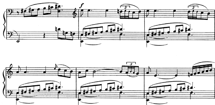
Example 4. Mode mixture as employed by Bela Bartók, Six Dances in Bulgarian Rhythm , no. 1, mm. 3–8, from Mikrokosmos , vol. 6. Dance in Bulgarian Rhythm no. 1 from Mikrokosmos by Béla Bartók. © Copyright 1940, 1987 by Hawkes & Son (London). Reprinted by permission.

All in all, clashes occur frequently in this mazurka on scale degrees 3, 4, 6, and 7. Analysis of clashes by scale degree will be taken up in the last section.