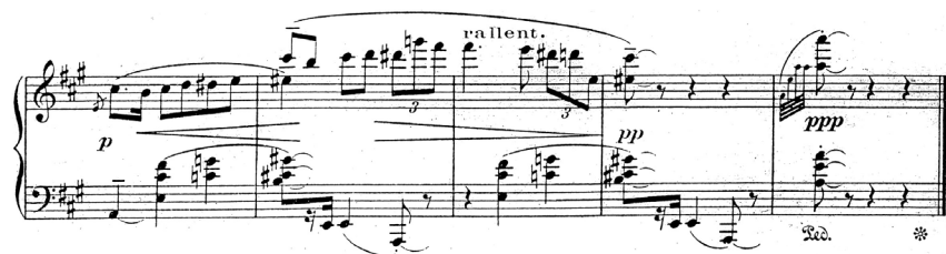
Example 8: Szymanowski clash on the fifth: Mazurka op. 62, no. 1, mm. 75–9. With the kind authorization of Editions Durand.

of the otherwise whole-tone harmonic background, it provides the half steps necessary to break the harmonic stasis, and thereby completes the retransition. 44 The G# in this fifth functions once again as a leading tone in the final cadence of the mazurka.