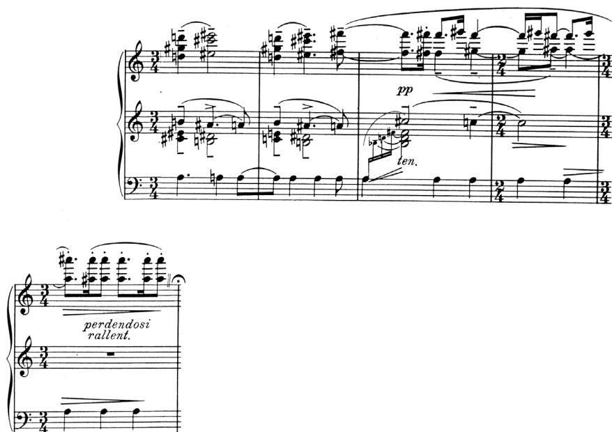
Example 9: Szymanowski clash on the tonic note: Sheherazade, op. 34, no. 1, mm. 5–9. “Masques, op. 34” © 1919 by Universal Edition A.G., Wien/UE 5858. Karol Szymanowski “Masques | 3 Morceaux | für Klavier | op. 34”. © Copyright 1919 by Universal Edition A.G., Wien/UE 5858. www.universaledition.com

When the Szymanowski clash takes place on the tonic against its chromatic upper neighbour, it tends to imply vigorous bitonal competition. 46 It can even imply an entirely false tonic. A very interesting case of bitonal conflict can be found in the Mazurka op. 50, no. 5, which is among the most dissonant of this set.