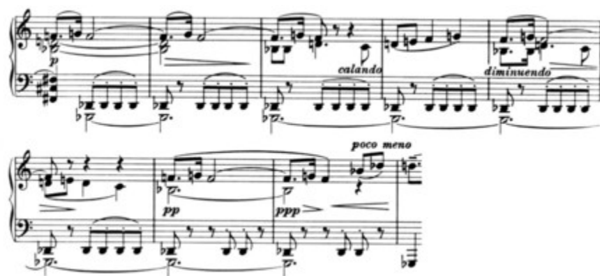
Example 1b: Conflict of G-flat vs. B-flat tonal regions in the Mazurka op. 50, no. 4, mm. 27–34. Karol Szymanowski “Mazurkas | für Klavier | op. 50”. © Copyright 1926 by Universal Edition A.G., Wien. www.universaledition.com

of conflict or instability during the main body of the piece are taken up again and resolved in the coda. In this mazurka, the B b tonality in the right hand gradually gains supremacy over the G b bagpipe—a rare example in which the treble wrests harmonic control away from the bass. Perhaps this turn of events explains the G b bagpipe’s violent protestations in the form of gruff sforzando chords (mm. 99–100). As a final bit of mischief, the right hand ventures off onto a G major triad in 112–14: a new sonority departing from the dissonant major-third relationship noted above. At the very end, though, B b is sonorous and firmly in control, subito ff . The closing cadence consists of no more than an emphatic statement of this open fifth on this B b . 9