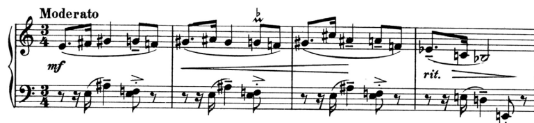
Example 10: Bitonal conflict between E and B-flat: opening of Mazurka op. 50, no. 5, mm. 1–4. Karol Szymanowski “Mazurkas | für Klavier | op. 50”. © Copyright 1926 by Universal Edition A.G., Wien. www.universaledition.com

The dual nature of the melody is confirmed by the nervous climax in m. 12, when the poles are reversed: the bass resonates B \flat while the melody begins and ends on E (F \flat , at first). At the centre of the conflict is the clash against the strong F in the left hand’s bagpipe fifth. The E/F conflict is significant also later: in mm. 63–5, F briefly takes over from E as the supporting harmony (an ironic twist), but it fares even worse than E at resolving harmonic tensions, because the A and G \sharp in the tenor range harmonize the “wrong” melody notes. The E/F conflict is finally resolved in favour of E in the work’s coda (mm. 81 to the end), where the tritone polarity of E vs. B \flat is distilled to its essence.