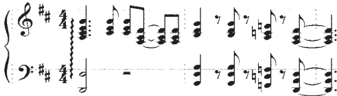
Example 4. Final measures of “Free Man in Paris” and the introduction to “People’s Parties”

that enhance the meaning of the text, carrying such contextual weight that the few cadences that occur on G are rendered almost impotent by comparison, further weakened by the addition of major sevenths and ninths. Ultimately, A triumphs over G in the fourteen-measure tag at the end of the song. While the strings play a plaintive melody in 3/4 time accompanied by an A minor pedal, one hears the piano’s right hand playing quarter-note quadruplets on a G triad against it in a four-against-three rhythmic pattern (example 5). Although the quadruplets are an almost visual portrayal of the lyric “I called out to be released,” they are strikingly reminiscent of the “knocking” triplet figure in the introduction to “Court and Spark.” However, the roles have been reversed here: the protagonist, not her lover, is knocking or pounding on the virtual doors or walls that imprison her. Chillingly, the knocking gradually slows, weakens, and disappears completely, swallowed by the A minor harmony that carries the final four measures.