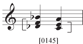
Example 3: Oscillating minor triads in section III

The end of section III centres again on the B-flat minor chord, this time in oscillation with the A minor chord a semitone lower. As illustrated in example 3, the combination of these two chords generates the [0145] cell that is important to melody 2. The musical processes that govern the end of this section will be discussed in detail below.