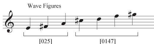
Example 4: Wave-like figures in section IV (choir 1)

particular texture featuring rhythmic counterpoint: at the beginning of page 30, the first choir chromatically fills A to C-sharp, then A to C at the end of page 31. Finally, as the climax of the piece approaches (beginning at 33), an even smaller major second-wide cluster in both choirs gradually contracts to B-flat, its point of symmetry. Example 5 summarizes this gradual cluster contraction from a tritone to a unison B-flat just before the climax of section V. The only voice to skirt this trend and effectively create its own musical layer is the seventh voice.