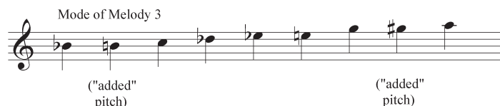
Example 9: Mode of melody 3

Beginning on page 54, amidst this dense counterpoint, Vivier introduces melody 3 in voice 1. It begins on B-flat, like melody 1, and is based on a transposed version of the mode of melody 1, as illustrated in example 9. Like melody 1, it uses all but one pitch (F-sharp) from an octatonic scale, but adds two pitches extraneous to that scale: B and G-sharp. These additional pitches are each a major third away from the point of symmetry of the ambitus of this melody, E and D-sharp: B is a major third below D-sharp, and G-sharp a major third above E. This nine-note melodic mode can be seen as an outgrowth of the work's initial mode, just as the important pitch cell [0145] of melody 2 is an expansion of the [0134] cell from melody 1.