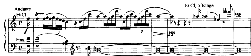
Example 10. The musicians' bitonal acoustic effects (Novák 1923, 147, bars 24–26; 148, bars 1–3)