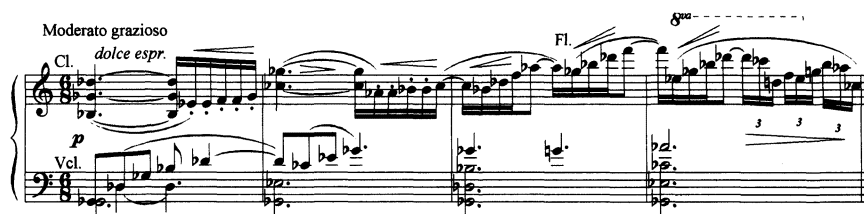
Example 5. The Princess's motive (Novák 1923, 100, bars 9–12)