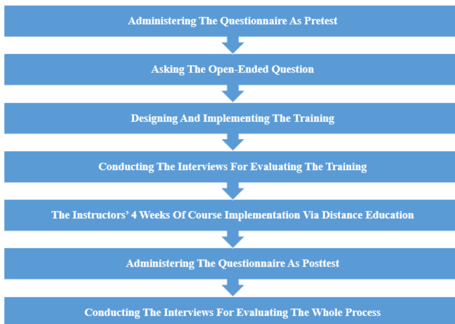
Figure 1. All procedures of the study.