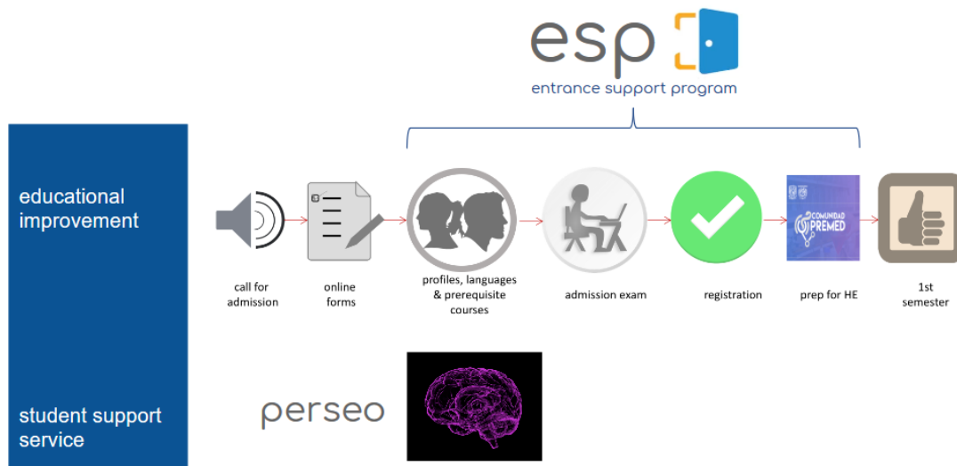
Figure 2. Entrance support process for candidates seeking entrance to undergraduate programs.

The complete entrance process of this support program is shown in Figure 2.