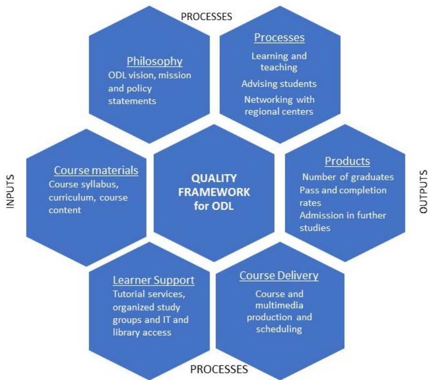
Figure 1. Quality assurance framework for ODL. Adapted from Quality assurance in open and distance learning: Trainers' kit 005 (p. 82), by COL & ADB, 1999, Vancouver: COL. Copyright 1999 by Commonwealth of Learning.

The evolution of OUs and the diverse ways they attempt to address quality gives rise to multiple questions: