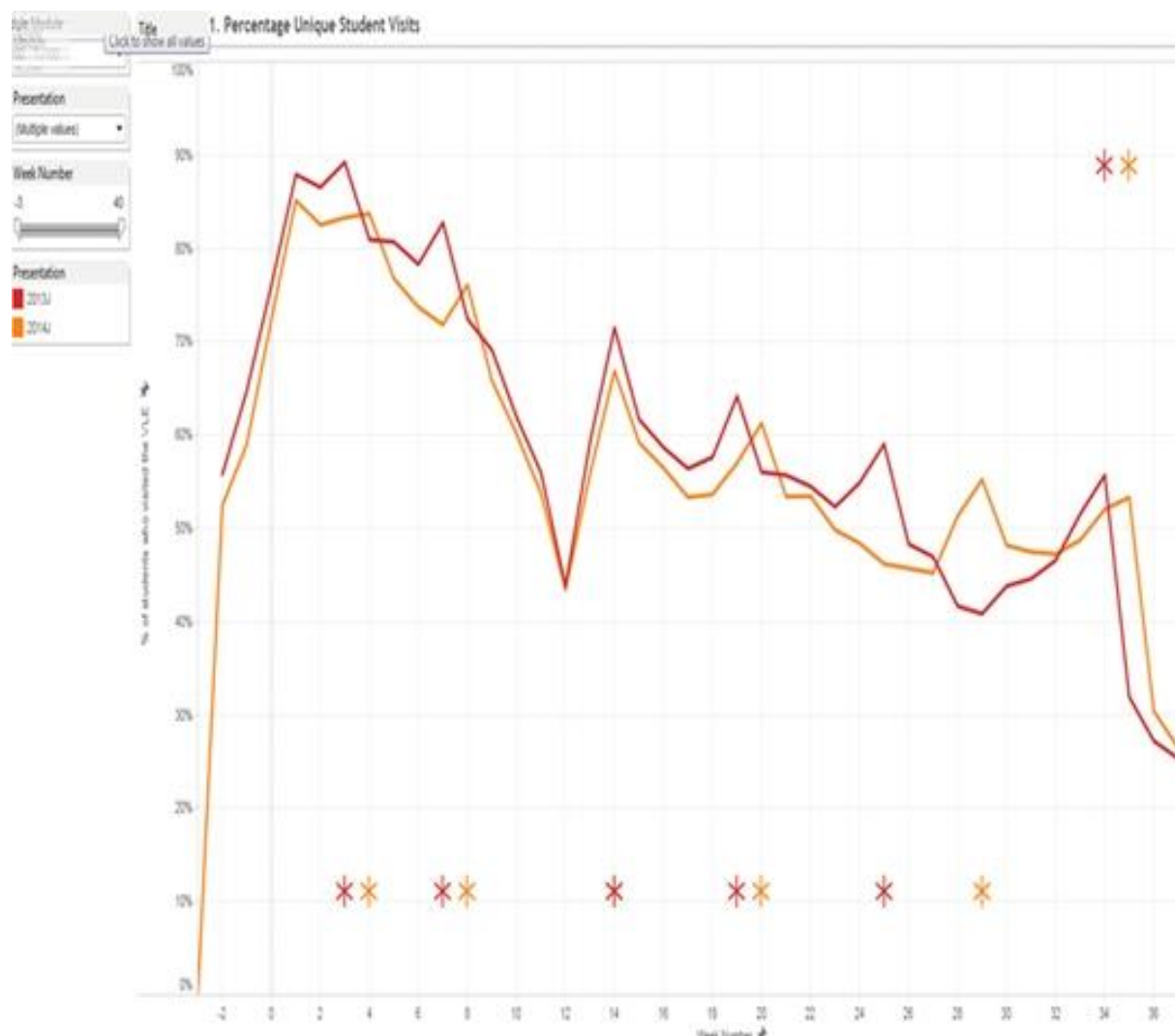
Figure 2. VLE engagement in case-study.