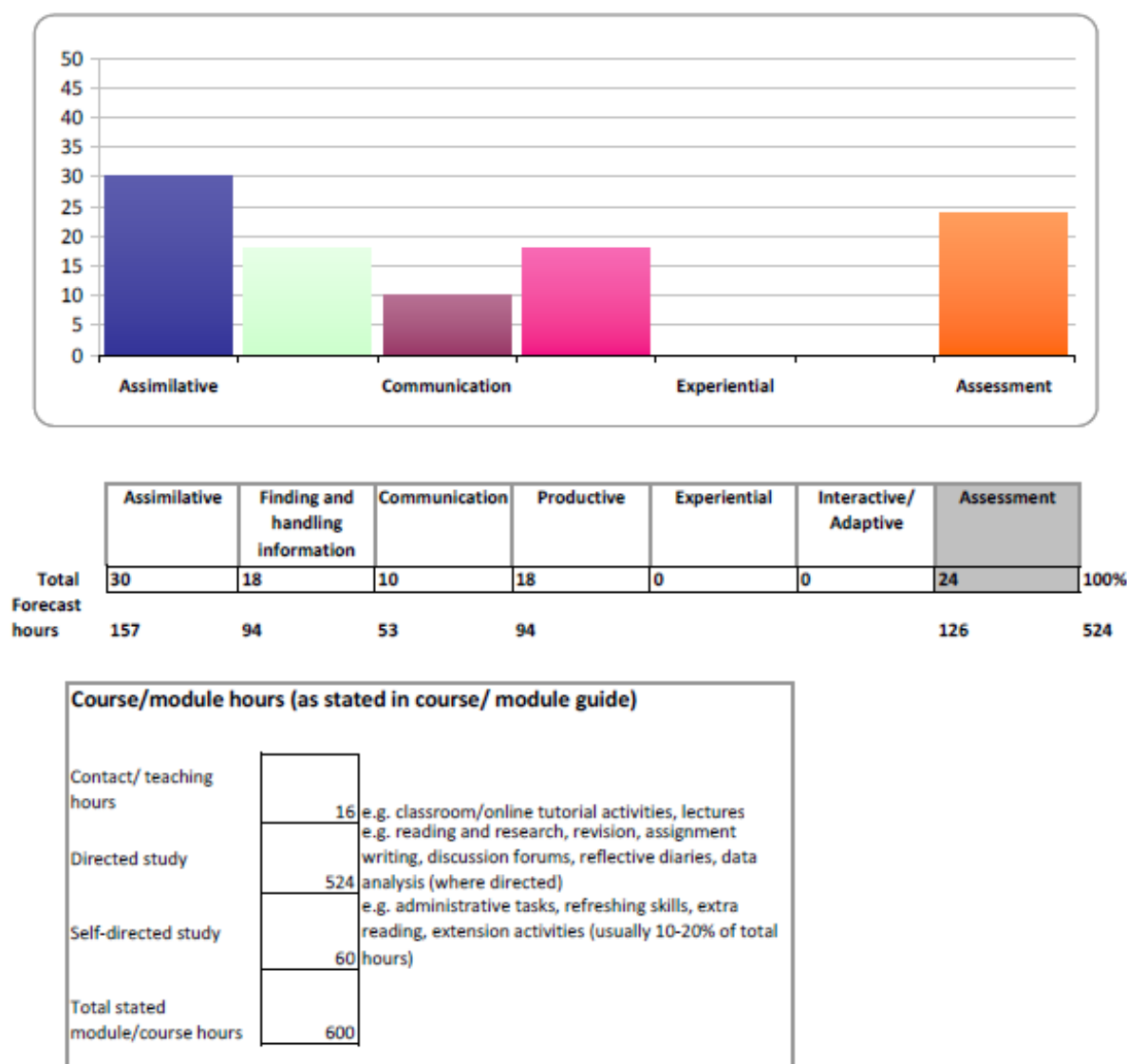
Figure 2. Activity Planner for the new planned module.