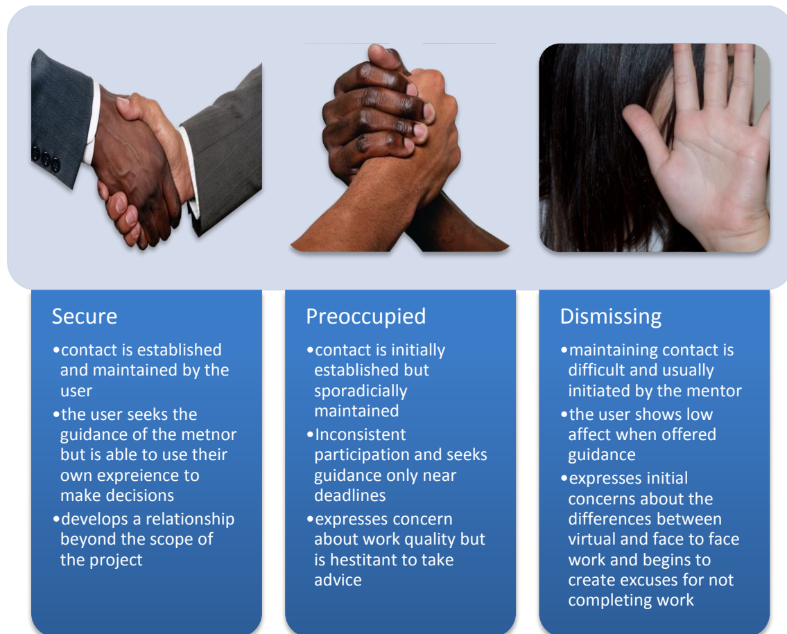
Figure 2. Understanding Virtual Attachment Theory.

dismissing attachment to their mentors who have mentors with a secure or preoccupied connection with their clients often do not maintain contact, make excuses early on in the project and ultimately may not complete the project or drop out of the program entirely. In practical terms this suggests that the level of collegiality among mentors and clients affects the relationship that the intern and client develop. Explicit, clear communication between clients, mentors, and interns during the virtual internship led to secure attachments and internships that ended in completed projects meeting all of the criteria.