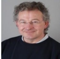
F.H.T de Langen Open University, The Netherlands