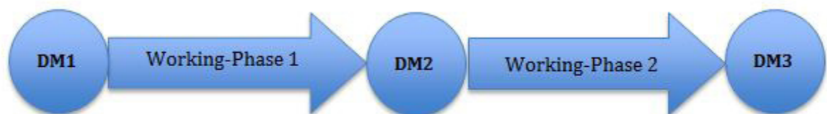
Figure 1. Temporal pattern of group collaboration process.

A temporal pattern of group behavior changes across the six groups is presented in Figure 1. The figure represents how the groups moved toward making decisions that were necessary for completing the group paper. All the groups went through three decision-making points (DM1, DM2, and DM3) and had two working-phases (working-phase 1 and 2) between the decision-making points. The first decision-making point (DM1) was for selecting a problem from the given two options. The second decision (DM2) was for structuring the group paper that was going to be the basis for dividing the task into individual portions. The final decision (DM3) was to reach a consensus for completing and submitting the paper. During working-phase 1, the groups that had selected problem option 1 spent time mostly on reading the documents provided on the course Web site while the other groups working with option 2 was brainstorming to create an imaginary context of a case. The working-phase 2 was a time period of writing individually, commenting on each other's works, compiling the individual pieces, and editing the compiled paper.