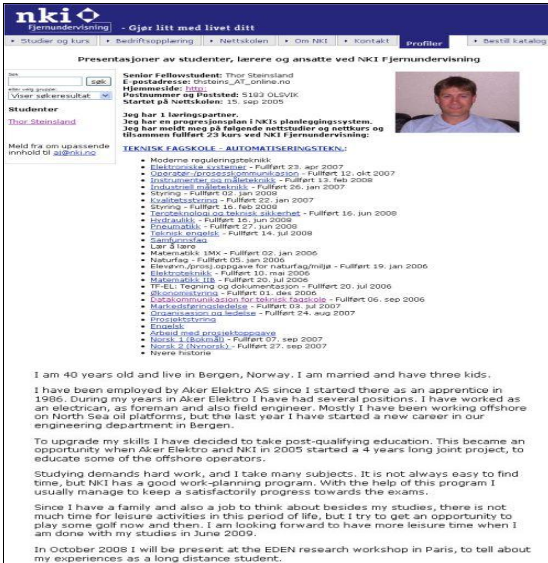
Figure 4. A personal presentation of an NKI student.

CLIPs may build on theories, ideas, and features discussed in social capital and social software literature. Resnick (2002, p. 1) argues that socio technical capital is a new construct that provides a framework for generating and evaluating technology-mediated social relations. In online education one may think of this as learning capital. In a blog entry, Butterfield (2003) characterizes social software as tools that people use to interact with other people, employing information about identity, presence, relationships, conversations, and groups.