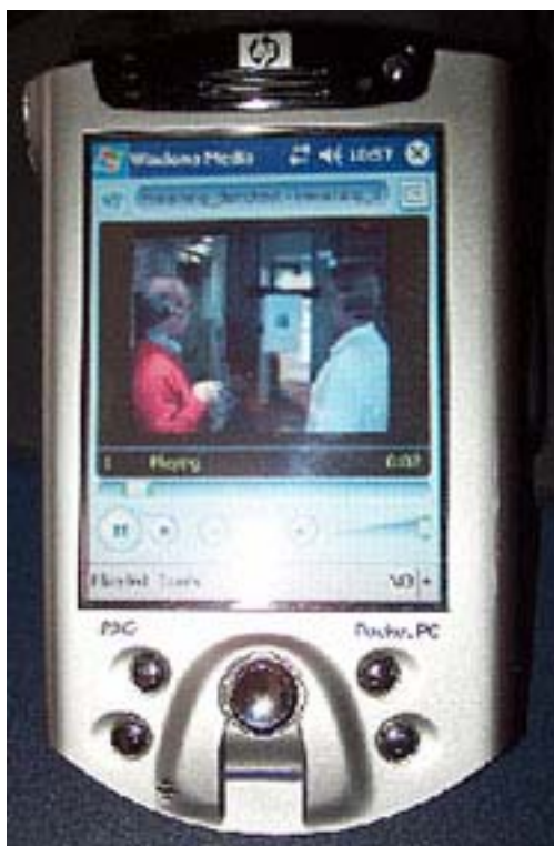
Figure 5. Video on the PDA