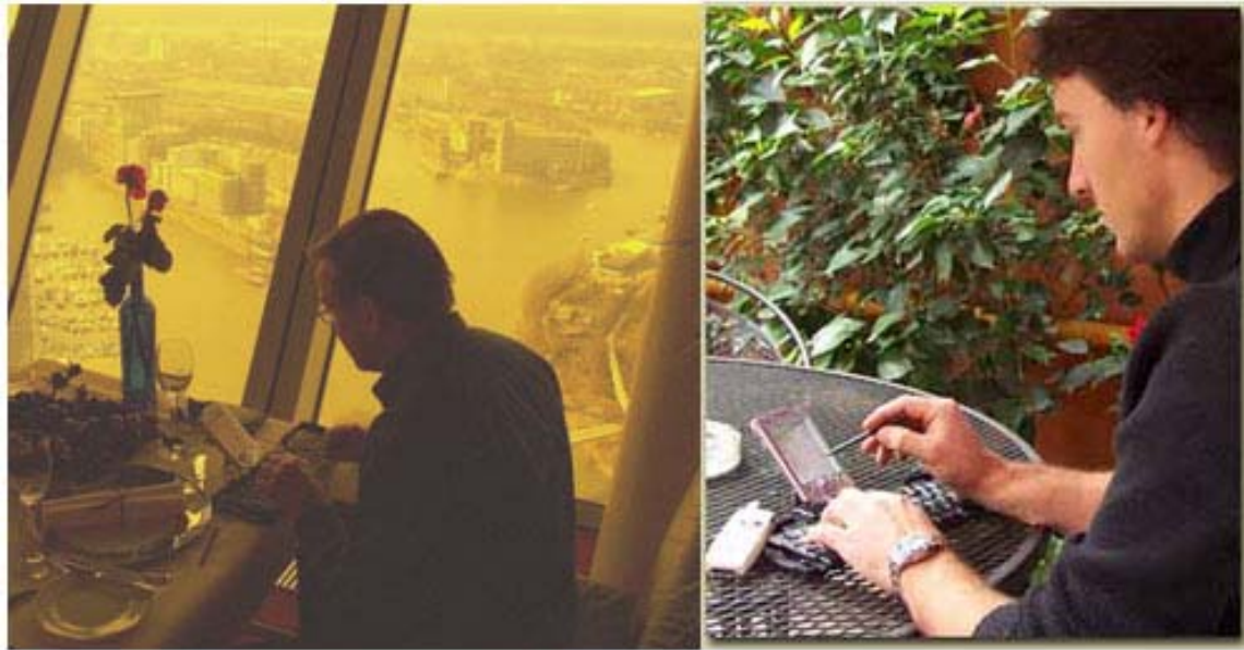
Figure 2. The picture on the left shows a tutor 'on the move,' writing and sending emails to his students from Düsseldorf 'Himmelturm.' The next picture is of a student on holiday communicating from the garden of his hotel in Rome.