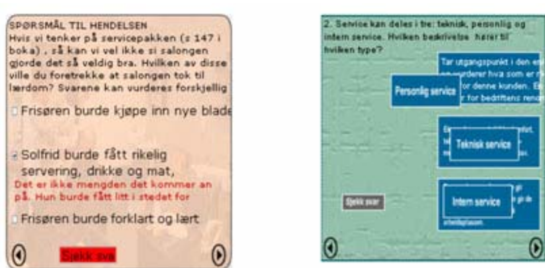
Figure 4. Screen shots from the PDA of multi-media multiple-choice question and 'drag-and-drop' assignment.

It was clear during internal testing that the solutions functioned according to expectations; they allowed all students in the course, irrespective if they were mobile or tied to a desktop computer, to participate and communicate in the same course. However, because additional materials had to be developed specifically for the mobile learners, we found that these solutions could never be applied cost-effectively on a large scale.