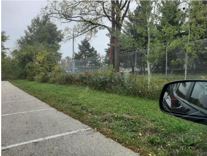
Figure 2 Barbed Wire Fence and Security Camera at the Prison.

building, park, and then walk up and down the long driveway which shares a fence with the prison. Figure 2 shows where I listened to the recordings while on the same land and in view of the prison. This process brought up a lot of embodied feelings for me, which I reflect on, and make meaning from, in the next section.