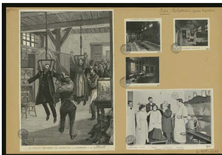
Figure 2: Paris, centre hospitalier universitaire Pitié-Salpêtrière, intérieur. Bibliothèque Historique de la Ville de Paris Cote 1-EST-02480. Public Domain.

Abbasi deliberately invokes traumatic histories of institutionalization and forced sterilization (Thompson) when Tina's adoptive human father tells her about the facility from which Tina was rescued. Imagined as a cross between a Salpêtrière and a Ravensbrück, this institution systematically eradicated the troll people in service of some unarticulated notion of racial/species hygiene, leaving Tina's troll