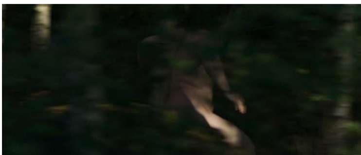
Figure 5: Haptic cinema: Tina's ek-static wilding. Border (Gräns) (2018). Directed by Ali Abbasi, cinematography by Nadim Carlsen.

It is necessary to return to the question of matter as mater , that is, as mother, matrix, or womb. Throughout the film, vivophilia (Behar), that is, its "configuration of matter as a site of generation or origi-