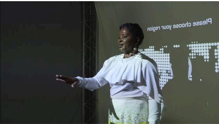
Figure 4: First Lady of Namibia Monica Geingos plays Shadowpox at the <Immune Nations> opening, UNAIDS, 2017.