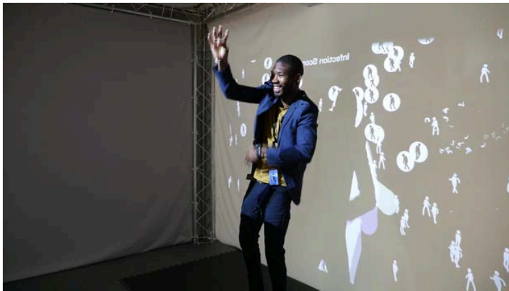
Figure 1: Shadowpox player at the <Immune Nations> exhibition opening, UNAIDS, 2017.