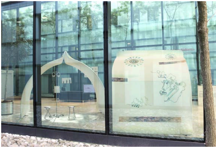
Figure 7: Installation view (from exterior courtyard), Design for a Dissemination Station , UNAIDS, Geneva, 2017. Portable tent structures with sound installation.