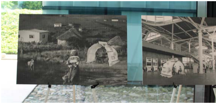
Figure 5: Display photographs of proposed D4DS usages (detail), Design for a Dissemination Station , UNAIDS, Geneva, 2017. Portable tent structures with sound installation.