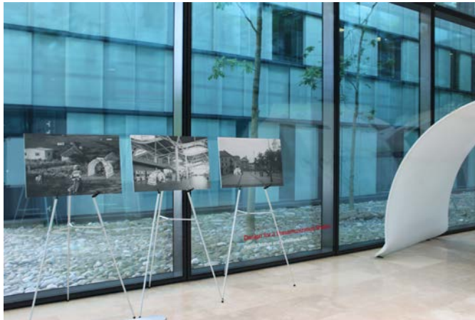
Figure 4: Display photographs of proposed D4DS usages, Design for a Disseminization Station , UNAIDS, Geneva, 2017. Portable tent structures with sound installation.

access (to good information, and, for many in the world, to vaccines themselves), and debating ideas regarding representation. In the latter regard, the pair asked broadly, “What do vaccines ‘look like’? How do we understand vaccines through various forms of visual representation, through the image culture that we are exposed to?” This led to research into biomimicry—the design of materials and structures modelled on biological entities and processes. At this point, they also began to discuss the degree to which, given the global context they hoped to deal with, their work should be committed to ideas of mobility—not only the mobility required to distribute information and vaccines themselves, but the realization that if art is going to offer meaningful impact in the context of vaccine discussions and realities, then the artwork itself would need to invoke forms of mobility through its propositional character and its structure.