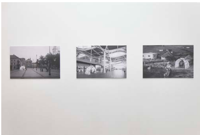
Annemarie Hou and Patrick Mahon, with Tegan Moore, Display photographs of proposed D4DS usages, Design for a Dissemunization Station , Galleri KiT, Trondheim, 2017. Portable tent structures with sound installation.