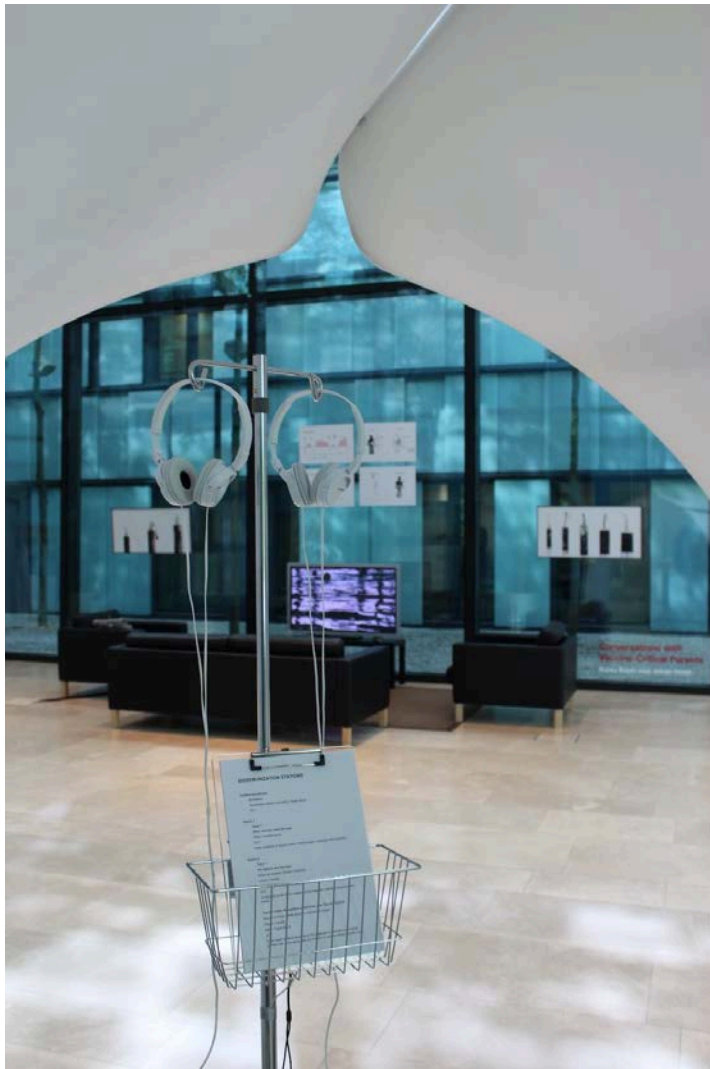
Figure 6: Installation of sound components by Tegan Moore, Design for a Dissemination Station , UNAIDS, Geneva, 2017. Portable tent structures with sound installation.