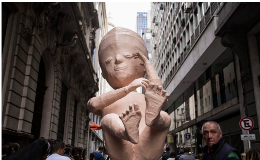
Fig. 1. Alma , M.A.F.I.A, 25 March 2018.

carrying signs in support of the congressional bill. On March 25, 31 marches against the legalization of abortion were organized in some of Argentina's largest cities. In Buenos Aires, the conservative organizations marched with an enormous papier-mâché fetus they called "Alma" [soul, spirit] (see Fig. 1), a name that evoked the transcendental nature these groups wanted to attribute to fetuses. More importantly, "Alma" revealed just how politicized the debate over legal abortion had become.