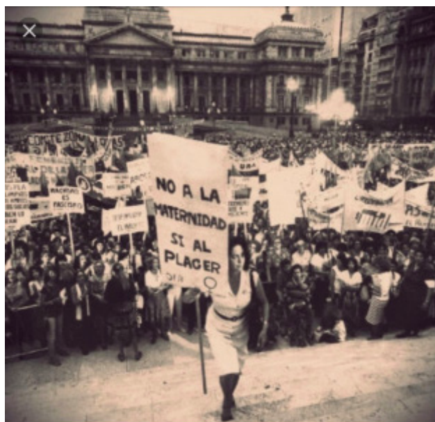
Fig. 2. Maria Elena Oddone , anonymous photographer, 8 March 1984

of media, times and contexts in which they interact,” as Sergio Martínez Luna says. 55 The images of feminine joy have travelled all over social media and have circulated in traditional public spaces all over the country; they connect people from the parks of Buenos Aires with girls that are far from the big cities and demonstrations, and include them in an amplified public space. Within the movement, public space is also the digital space where women converge, sharing dress codes, gestures, and makeup.