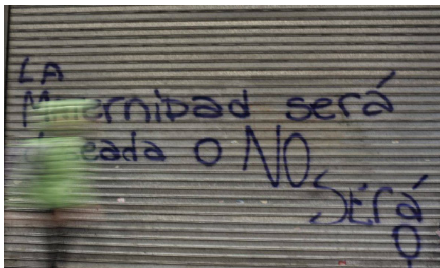
Fig. 3. Graffiti, Revista Crítica , June 2018.

With that sign, Oddone was affirming that pleasure (which we have called here jouissance ) is entirely separate from the desire to be a mother, suggesting that motherhood must be desired, not imposed as punishment for jouissance . This is also the idea behind the slogan "There is no motherhood without desire," a popular sign and graffiti during the marches and rallies to support legal abortion (see Fig. 3).