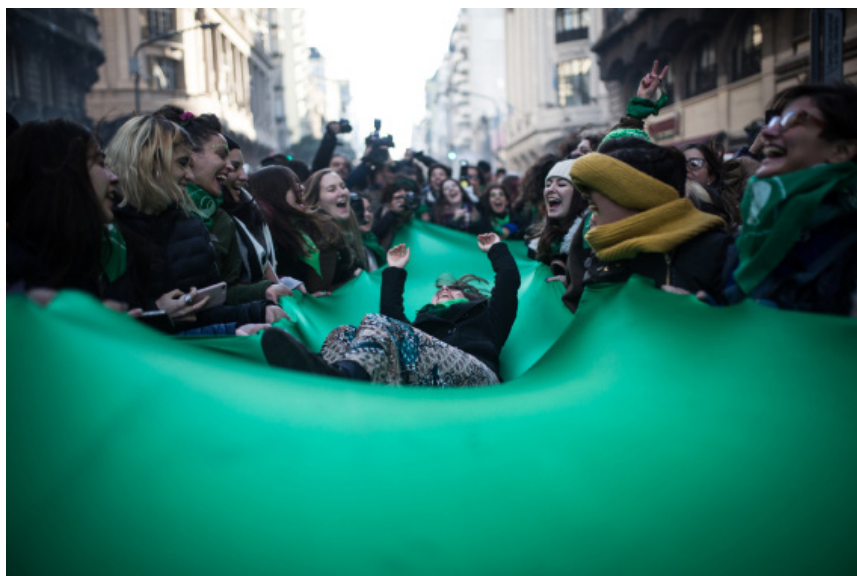
Fig. 18. Hamaca , M.A.F.I.A., 13 June 2018.

the images discussed here is an archontic principle that contests what can be seen. Here the remnants of patriarchal and heteronormative history are recovered in order to desecrate that history, 60 enabling a reading of women's joy as a lived experience, an integral part of the struggles for recognition.