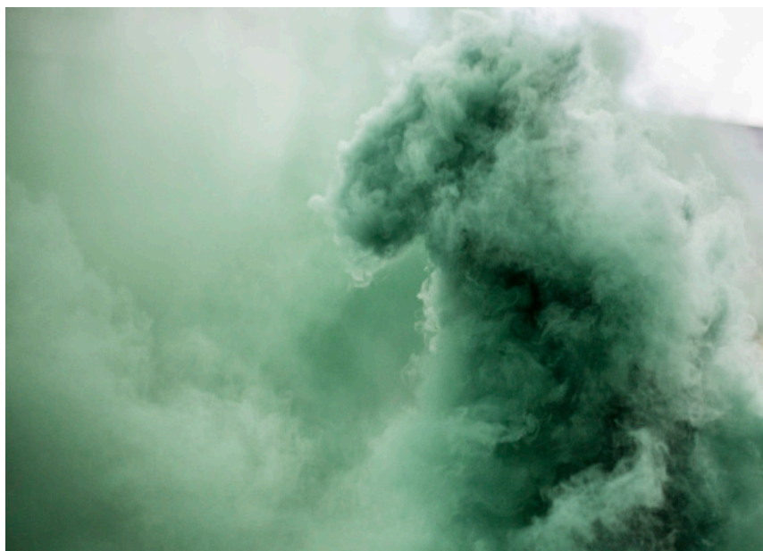
Fig. 6. Pañuelazo , Lucía Prieto, 18 February 2018.

In stark contrast with these images that evoke tragedy and the state's double standard—classics in Argentine feminism—the “green wave” recreates another type of museum. From that first pañuelazo for legal abortion on February 18, 2018, the time seems to have come to advertise women's joy, jouissance , and desire. Since then, at rallies in city squares across the country, and those held during the days of the congressional debate, the parks and social media were dyed emerald green. 56 Any number of green scarfs, flags, and flares (see Figs 6 and 7) shaped the configuration of the wave—that natural phenomenon that announces the coming of a tide—in the social imaginary. As scholar Magalí Haber has pointed out, this idea of the wave came first from the drone photographs.