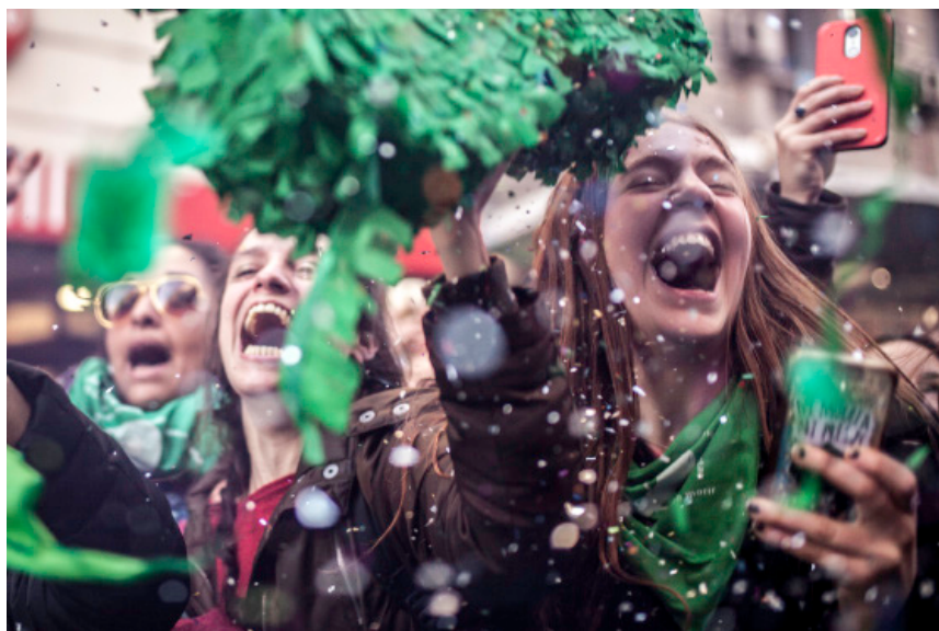
Fig. 17. Festejo , M.A.F.I.A, 13 June 2018.