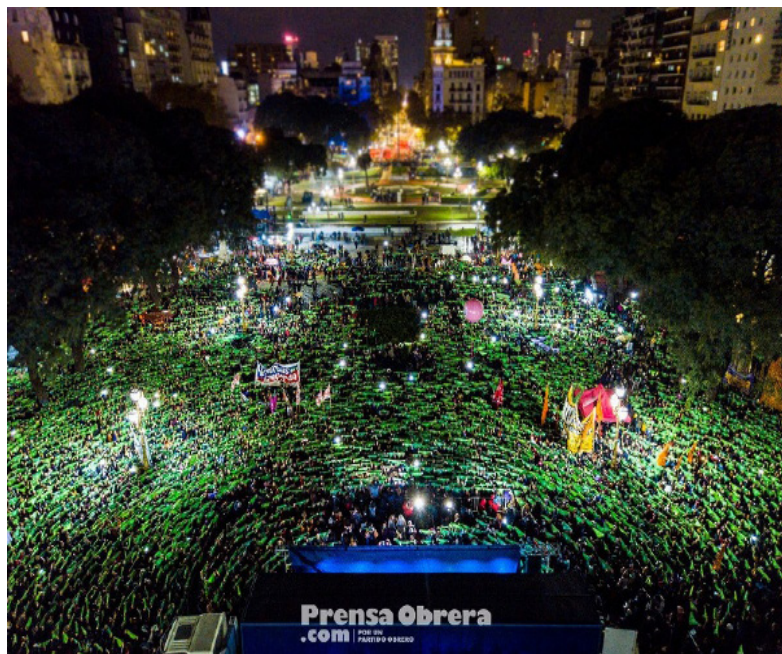
Fig. 8. Pañuelazo , Prensa Obrera , 8 March 2018.

Other images of these rallies (the most prolific of them probably from the demonstrations in 2018 and, to a lesser degree, in 2020) look more like Carnival celebrations and pride marches than like traditional (and more solemn) feminist marches in Argentina. The photos taken by the M.A.F.I.A. collective, Lucía Prieto and Guido Piotrkowski are representative of an enormous number of images, both amateur and professional, that circulated especially on social media during that time and constituted a true feminist virtual museum that records the joy generated by the feminist struggle. This photo gallery introduces a pathos of feminist joy that is truly significant for people with the ability to become pregnant in Argentina, thereby making an unprecedented and massive call to action. Women young and old are half-naked, baring bodies that do not necessarily reflect patriarchal standards of beauty. Made up and ornately outfitted, they sing and dance (see Figs 9–15). Photographer Lucía Prieto captures the democracy of this jouissance . Rather than a demand for the right to joy, what we see in her images is the affirmation that joy exists, even if some disregard it and others deny their joy or the joy of others—thus taking joy in