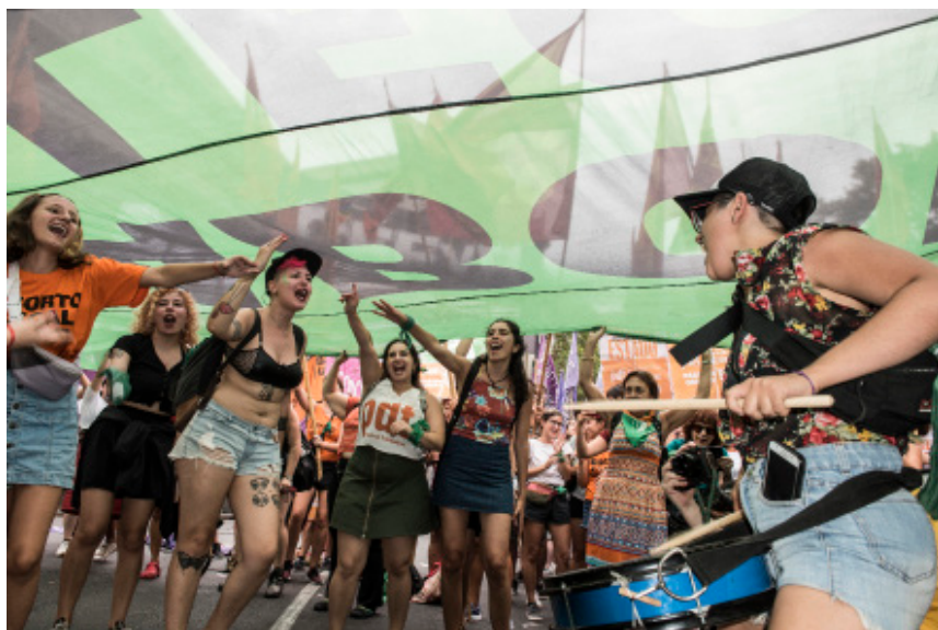
Fig. 16. Mujeres cantando y riendo , Guido Piotrkowski, 8 August 2018.