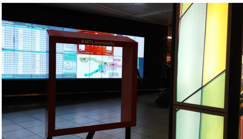
Fig. 1. Montréal-Trudeau International Airport.

Airports are key sites for the control, surveillance, and representation of transnational human mobility in the twenty-first century. As sites of border security and as crucial nodes for globalized networks, they include a broad range of media designed to reflect and capture human movement. Canada's major international airports include a number of devices for security screening, such as biometric imaging and x-ray scans, but also artworks that represent and subtly direct human mobility. Canada's three busiest airports—Toronto Pearson International Airport, Vancouver International Airport, and Montréal-Trudeau International Airport—notably aim to cultivate aesthetic and sensory experiences that contrast with the stringent controls on people's movements that airports after 9/11 are notorious for. Do the roles of media in airport security bear any