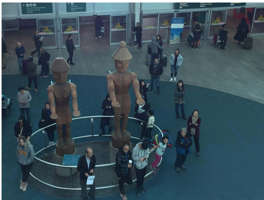
Fig. 4. Joe David, Welcome Figures , 1986, sculpture, red cedar, Vancouver International Airport.

510 Toronto's airport references regional institutions through curatorial showcases, and it has included cultural displays representing local museums, such as the Royal Ontario Museum and the Museum of Vision Science. 26 In this space, works are sited at different heights, thereby surrounding travellers as they navigate through its spacious atria. These include Jetstream (2003) by local artists Susan Schelle and Mark Gomes, an aluminium, granite, and bronze installation that hovers over travellers' heads, through swirling lines that evoke wind currents and weather patterns.