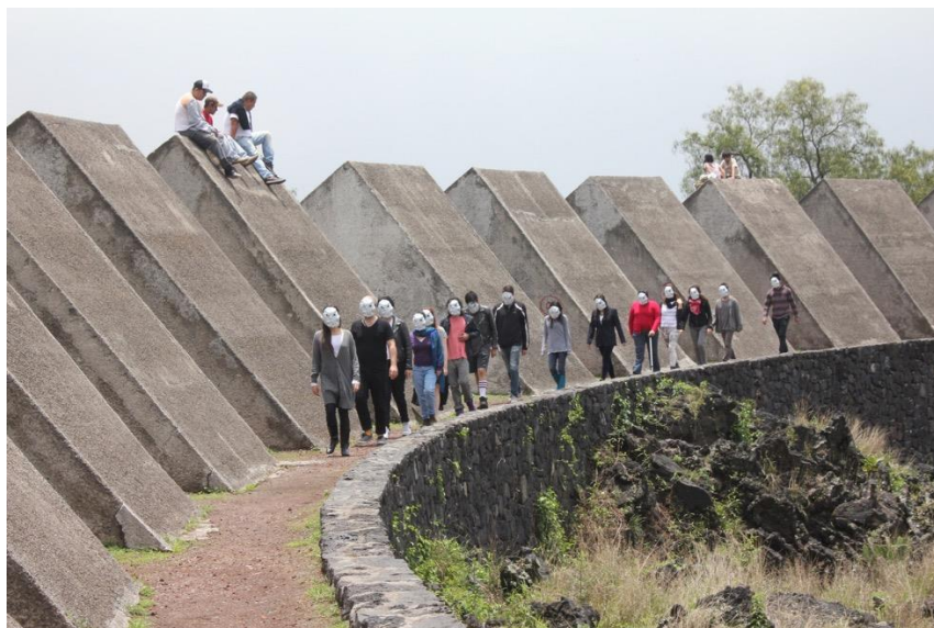
Fig. 4. Facial Weaponization Suite: Procession of Biometric Sorrows , MUAC [11] SEP Mexico City, Mexico [11] SEP , June 2014, photo by Orestes Montero Cruz. Reproduced with the kind permission of Zach Blas.

while at the same time maintaining the affirmation entangled with it. The word queer is itself a good example of such a process where a once-shaming epithet was taken back. In the same way, algorithmic governmentality could be understood to offer the material for constructing a discursive site, which it does not itself produce—material that can be appropriated and turned inhabitable.