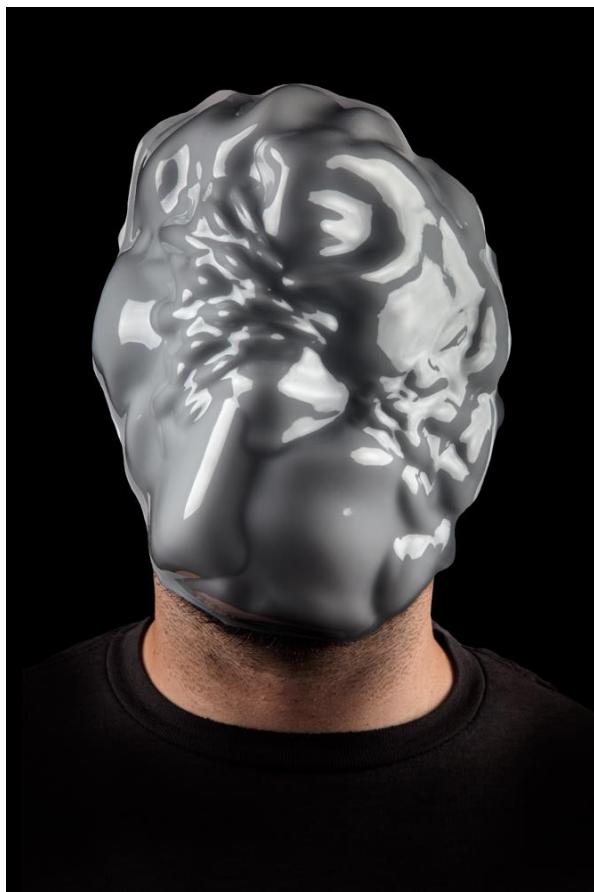
Fig. 1. Facial Weaponization Suite: Mask – 19 May 2014, Mexico City, Mexico, photo by Christopher O'Leary. Reproduced with the kind permission of Zach Blas.