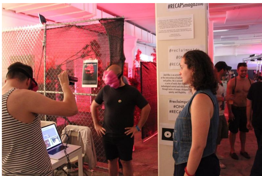
Fig. 2. Facial Weaponization Suite: Fag Face Scanning Station reclaim: pride with the ONE Archives and RECAPS Magazine Christopher Street West Pride Festival, West Hollywood, CA, 8 June 2013, photo by David Evans Frantz. Reproduced with the kind permission of Zach Blas.

but because it produces no subjectivation and thus offers no discursive site from which to question this kind of surveillance. When positioned in relation to Rouvroy and Berns' analysis, the Facial Weaponization Suite appears to envision a tactic of establishing this discursive site and thus allowing an engagement with what Rouvroy and Berns term algorithmic governmentality . My argument proposes that the wearing of multiple faces, which Blas describes as a resistance to biometric facial recognition, can then be read as the inhabitation of the profile that is itself constructed through the combination of diverse data.