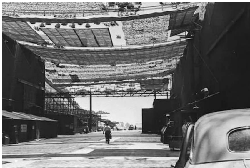
Fig. 4: Douglas employee walks underneath the camouflage designed by landscape architect Edward Huntsman-Trout to conceal the manufacture of military aircraft at the Douglas Aircraft Company Santa Monica plant during World War II. 1941–1945.

technological surveillance. 13 Digital surveillance seems to have replaced the atomic bomb as the utmost invisible and ubiquitous threat in the collective imagination.