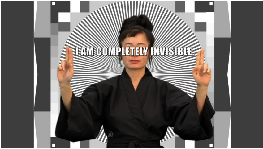
Fig. 1: Still from the film How Not to Be Seen: A Fucking Didactic Educational .MOV File , Ito Steyerl, 2013. HD video, single screen in architectural environment, 15 min 52 sec. Image courtesy of the Artist and Andrew Kreps Gallery, New York © Ito Steyerl CC 4.0.