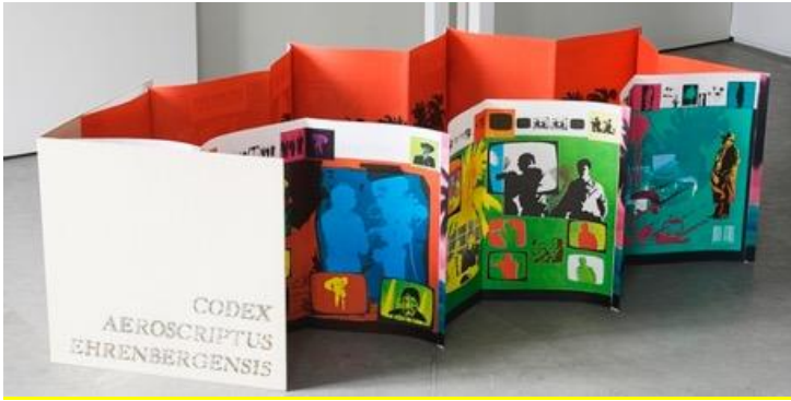
Fig. 4. Felipe Ehrenberg, Codex Aeroscriptus Ehrenbergensis , 1990, Atlanta, Nexus Press.