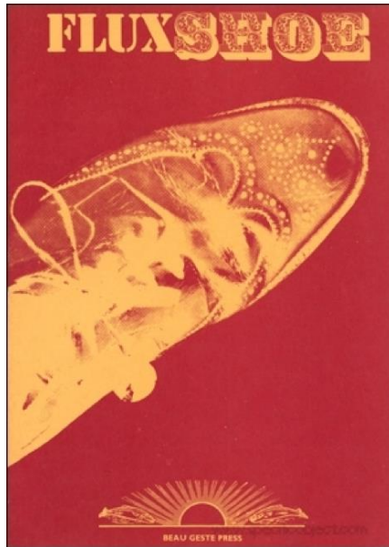
Fig. 1. Felipe Ehrenberg, cover of FLUXshoe , 1971, 29 x 21 cm., Devon: Beau Geste Press, 144 pp., unsigned and unnumbered. © Lourdes Hernández Fuentes.

But back to Ehrenberg. Besides his engagement in editorial projects, as an artist, he was highly influenced by conceptual and experimental art, exploring graphic design, painting, photography, collage, sculpture, and installations, but also creating book objects, such as the Codex Aeroscriptus Ehrerbergensis (1990) (see Fig. 4), as well as performance and sound poetry. Maneje con precaución [ Drive with Caution ] (1973) is probably his only known “sound poem,” also defined by him as the longest visual poem by ekphrasis. This piece was recorded during a car ride on Calzada Ignacio Zaragoza, one of Mexico City’s most active and popular downtown avenues, where he sees all sorts of posters and signs on the street that he attempts to read as if reading the urban landscape through description while speaking with the window open, thus allowing for the murmuring soundscape of traffic to become part of the recording and of the piece itself. 21