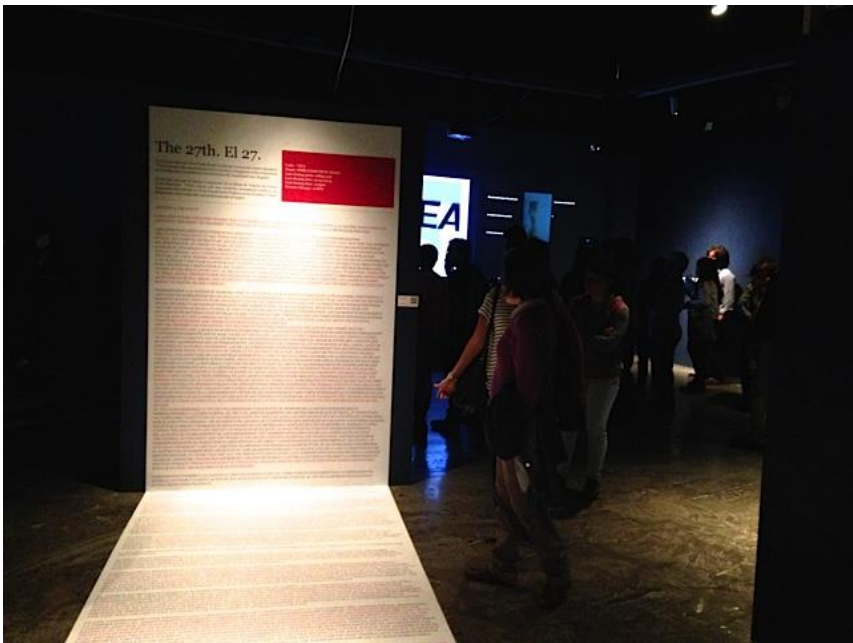
Fig. 9. Eugenio Tisselli, El 27 | The 27th , 2013, image of the exhibition Literatura electrónica: política y cuerpo en el presente digital [Electronic Literature: the Politics and the Body in the Digital Present], part of the project Plataformas de la imaginación [Platforms of the imagination], Centro Cultural Tlatelolco, Mexico City, novembre 2015–january 2016. Reproduced with the kind permission of Eugenio Tisselli.

national borders are originally part of the nation, but their ownership can be transmitted to individuals through the right of private property. The translated text always appears in red letters. Hereby, the piece involves programming, textual conditions, and social repercussions as a strongly critical statement. For different museum exhibitions, this piece has been presented as a material text, printed in a large format (plotter), which gives the impression of a large “red” carpet, with only a few textual elements left in Spanish. It is partially fixed on the wall and continues over the floor for some meters, expecting the visitor to read the text while physically and symbolically stepping on it. The whole project in its material treatment and disposition metaphorically speaks of many contemporary and political circumstances that are a consequence of the relationship between Mexico and the United States as neighbour countries. Again, as with the artists mentioned so far, in this piece Tisselli is consciously exploring and working with the implications of textuality as an ideological-discursive form, and the outreach of linguistic translation, only he refers to the complex networking-system that determines the act of this conversion.