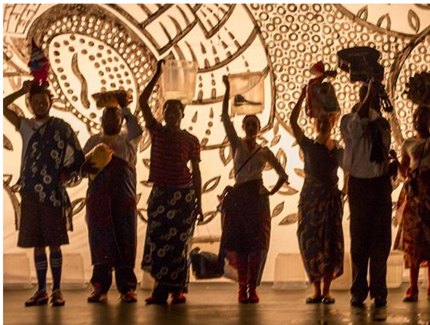
Fig. 4. Photography of the play Msonkhano.de/Begegnungen.mw , Fräulein Wunder AG, Hannover Germany and Solomonick Peacocks Theater company, 2014.