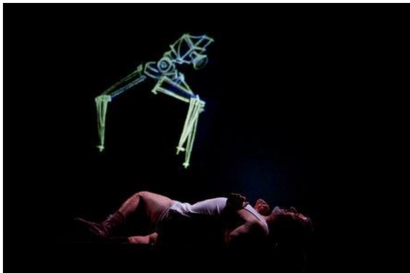
Fig. 1. Photography of the play Ubu And The Truth Commission , the handspring Puppet company, William Kentridge and Jane Taylor, 2014 © Canadian Stage.

932 On the other hand, the representation of apartheid horrors is enabled through the use of the animation and documentary film on the screen, invoking figurative and representative modes. The images of hanging, detention, parcel bombs, torture depicted in the animation, for example, are the audience's only window into the clandestine nocturnal activities of Ubu and his henchmen (represented both on stage and on screen by a three-headed dog).