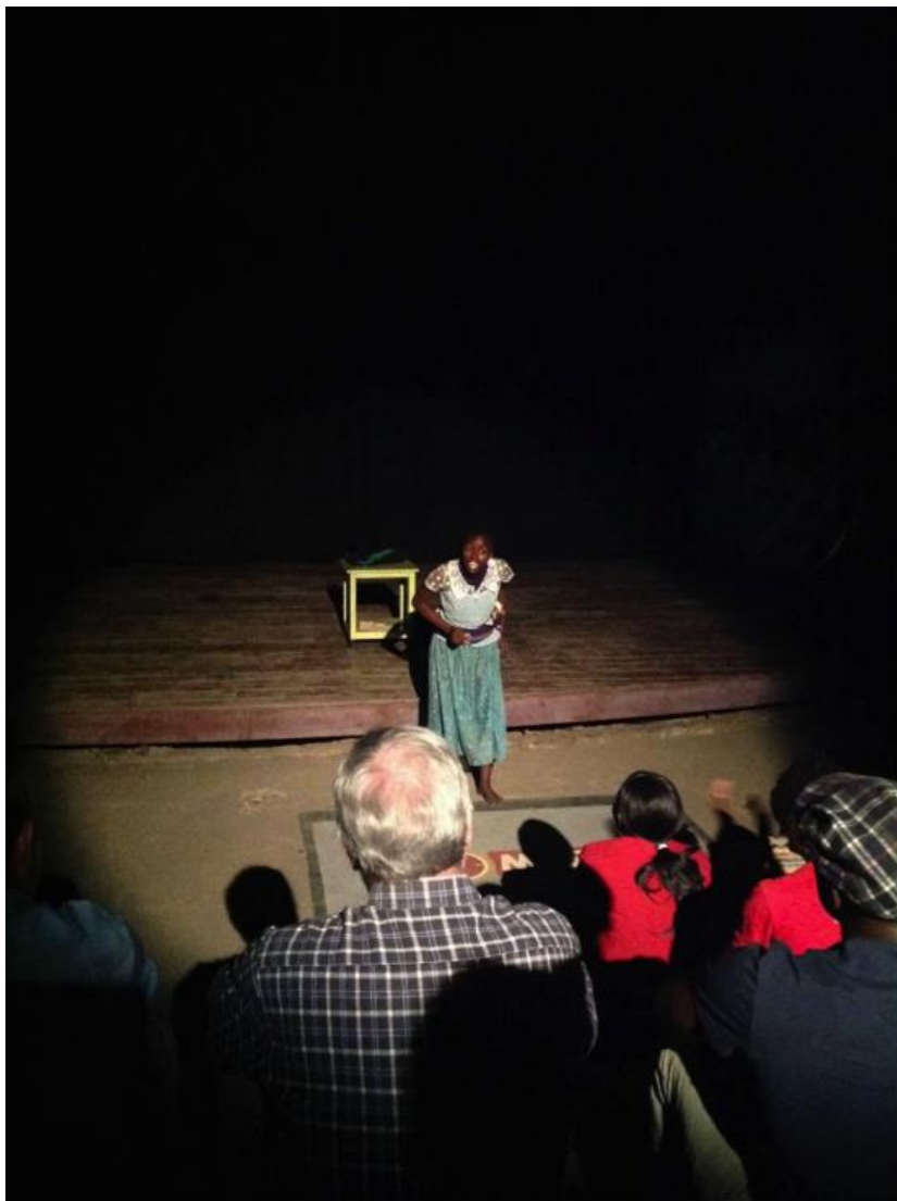
Fig. 3. Photography of the play MWANA WANGA , Catherine Makhumula, 2014. © Catherine Makhumula.