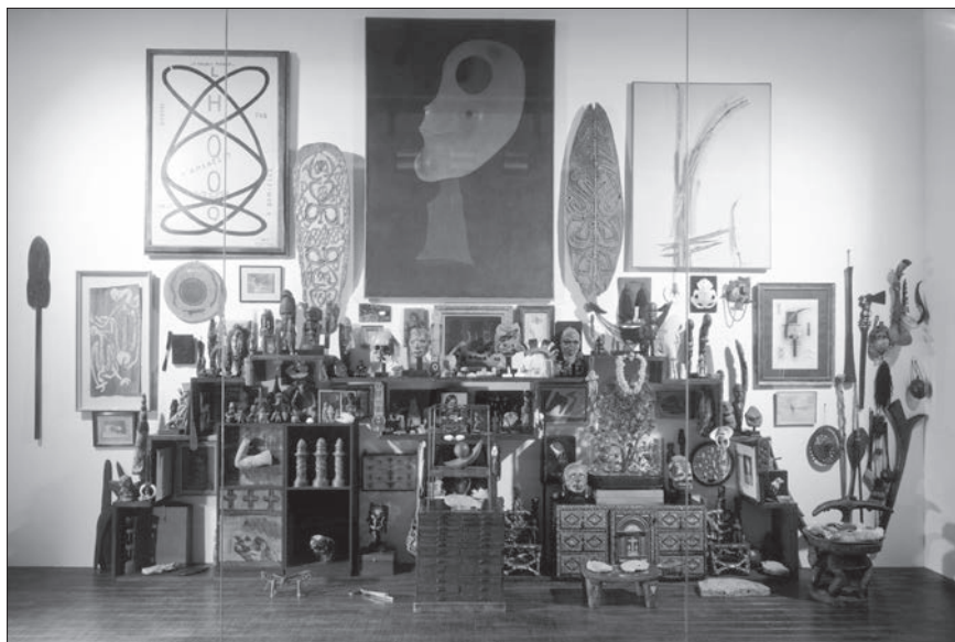
Fig. 2: Reconstruction of the wall of André Breton's studio on rue Fontaine, Paris. Musée National d'Art Moderne, Centre Georges Pompidou, Paris. Paintings by Miro, Picabia, Giacometti: © Artists Rights Society (ARS), New York.

indexed and photographed. 22 This recategorization—with its definitive separation of primitive from modern, high art from popular art, painting from text—does more to dissolve the studio's archival, or meta-archival, function than even the sale itself.