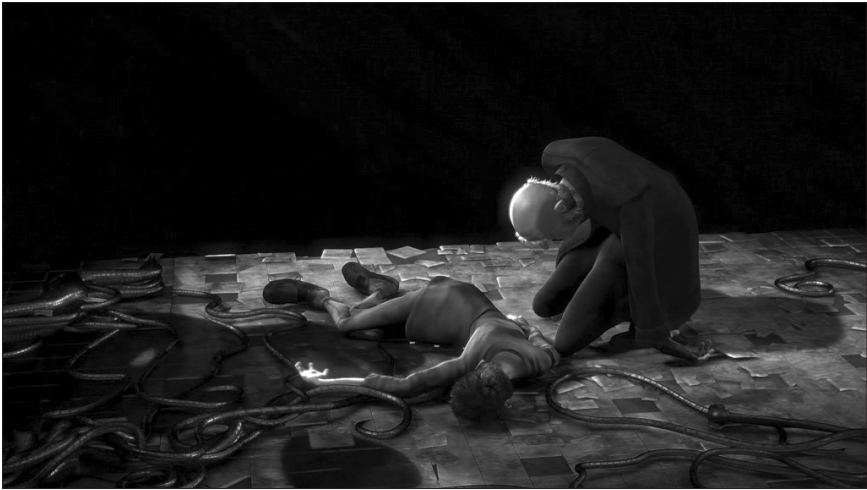
Fig 4: Proog kneels down to Emo's body—a dramatic ending without closure in Elephants Dream .

affect. We use affect in its Deleuzian sense as a moment of intensive quality, 30 or as a bloc of sensations waiting to be activated by a viewer. 31 Affect is an experience for the spectator that comes prior to meaning. It is according to Colebrook “a sensible or sensibility not organized into meaning.” 32