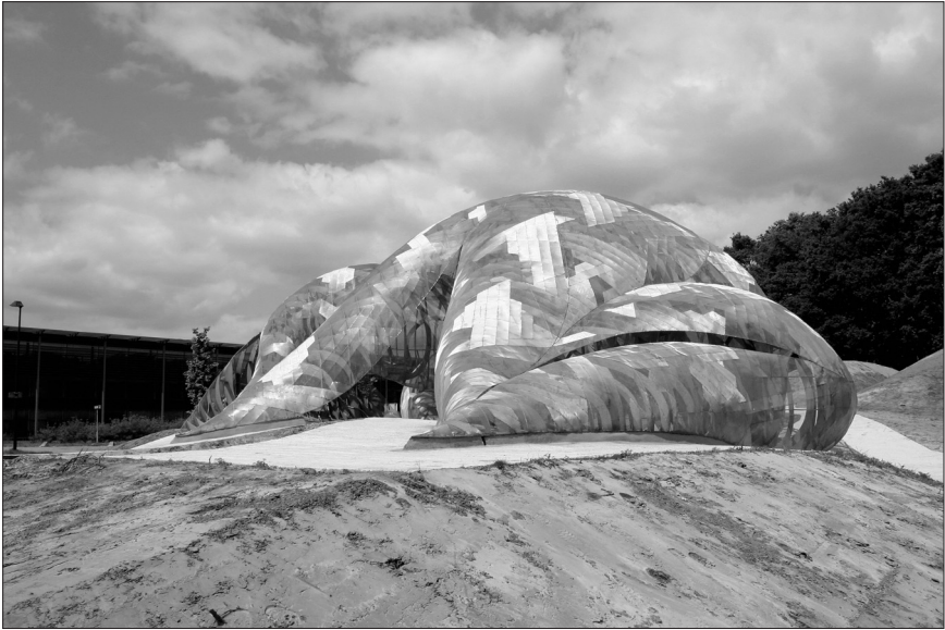
Fig.1: Son-O-House does not contain a single straight line. Paper model 2004. Courtesy NOX/Lars Spuybroek.

in collaborating with Spuybroek was “to get rid of the distinction between architecture and sound.” 14 This called for a spatial interpretation of sound, by which it could act on the same plane as architecture. In order to make the sounds in Son-O-House into a spatial composition, they are not based on identical repetition but rather on internal difference, that is, on constant variation and development. This process is constituted through interactivity. The Son-O-House is divided into five sound fields which each have four loudspeakers. Throughout the building twenty-four sensors are placed at different heights and in different positions.