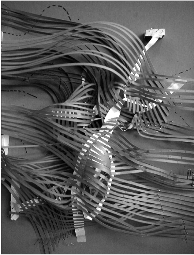
Fig. 2: Paper strips form a complex structure of bent arches, generated by the material itself. Picture of model Son-O-House 2004.

more movement, this can be understood as the result of sound transition. In such a case, the system stores the sounds for possible future re-use. A double-sided interactive process is thus at work: by their movements visitors leave traces in the continuously changing composition of Son-O-House , while at the same time the system learns which sounds are most effective in triggering and influencing human movement. It is important to note that the musical interaction is indirect: a visitor does not drastically alter the featured sounds, nor will she easily perceive the influence she has. Instead, the overall sound composition gradually changes due to human movements. Son-O-House builds on the generative difference between sound and architecture, allowing both media to meet through spatial connections. Mark Hansen's analysis of Son-O-House astutely points out that the musical and architectural interaction both define space through movement, in