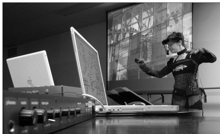
Fig. 2: Bodycoder System: The Suicided Voice in rehearsal, 2005-2007.

The Bodycoder System differs from other data acquisition systems that analyze movement data but do not allow the performer or human agent access to that data. For us the performer’s ability to selectively input and control the