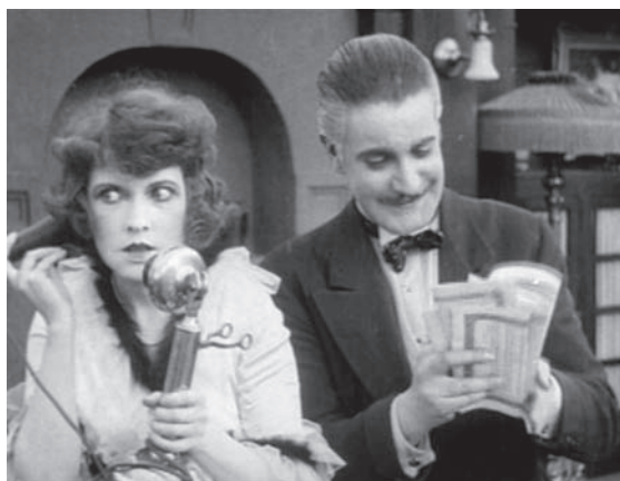
Figs. 6-8. Cecil B. DeMille, The Cheat , 1915.