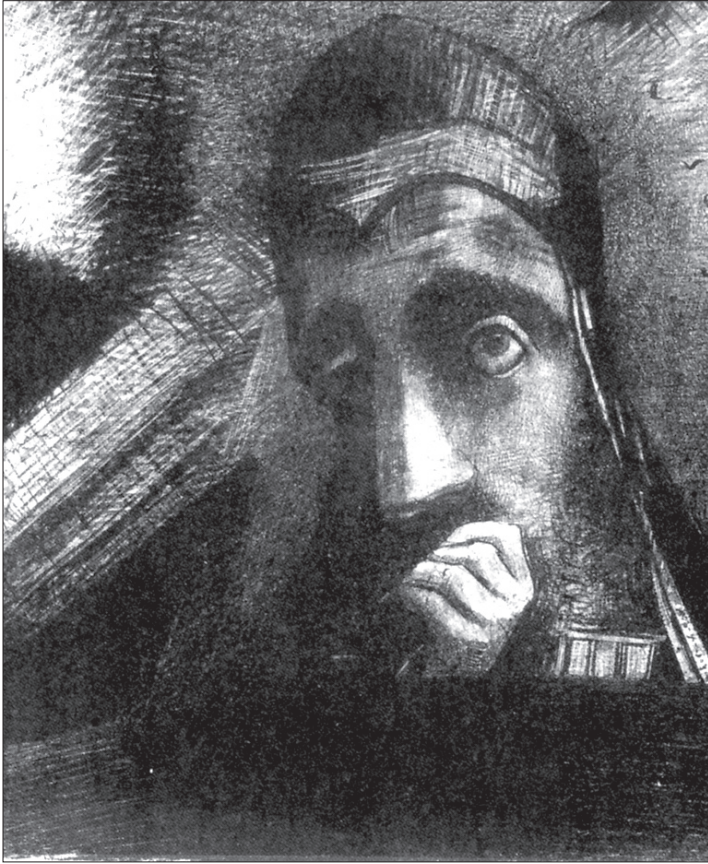
Fig. 2. Odilon Redon, "Dans mon rêve, je vis au Ciel un VISAGE DE MYSTÈRE," Plate 1 from Hommage à Goya , 1885.

intelligibility. The images are paired with captions that structure the sequence, but the series permits undetermined associations and reversals, allowing a folding of the different faces—the faces of difference—and the affects they provoke.