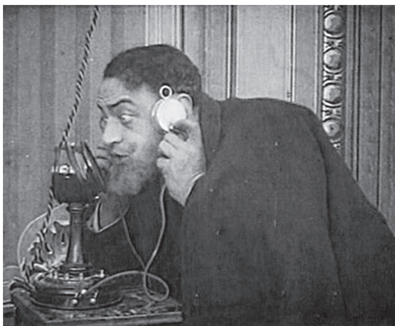
Figs. 4-5. Le médecin du château , Pathé, 1908.