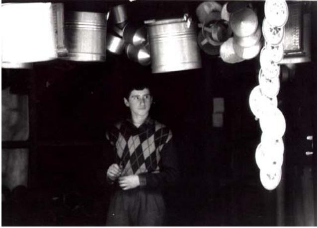
Fig. 3. Still from Look at me (1998) by Petek Berksoy.