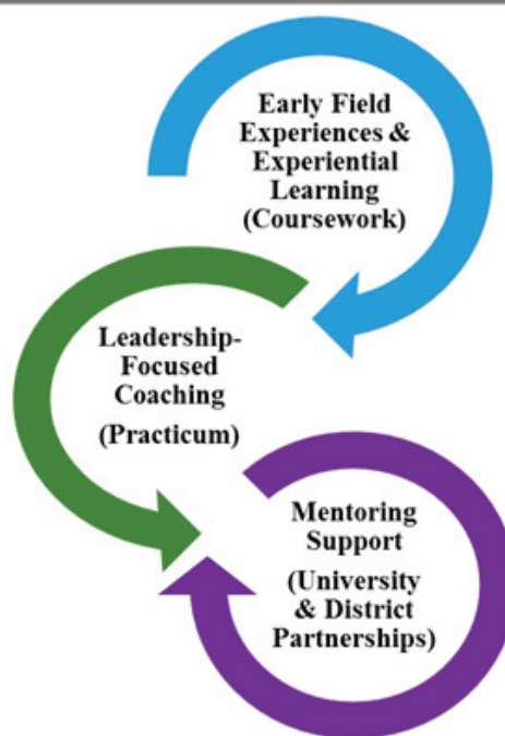
Figure 1: Conceptual diagram of model

The final part of the conceptual model involves mentoring support within the school district. Once in leadership positions, districts would select principal or district-level mentors for new instructional leaders. University instructors would support this by developing and providing ongoing mentoring workshops, professional development, and resources for such mentors.