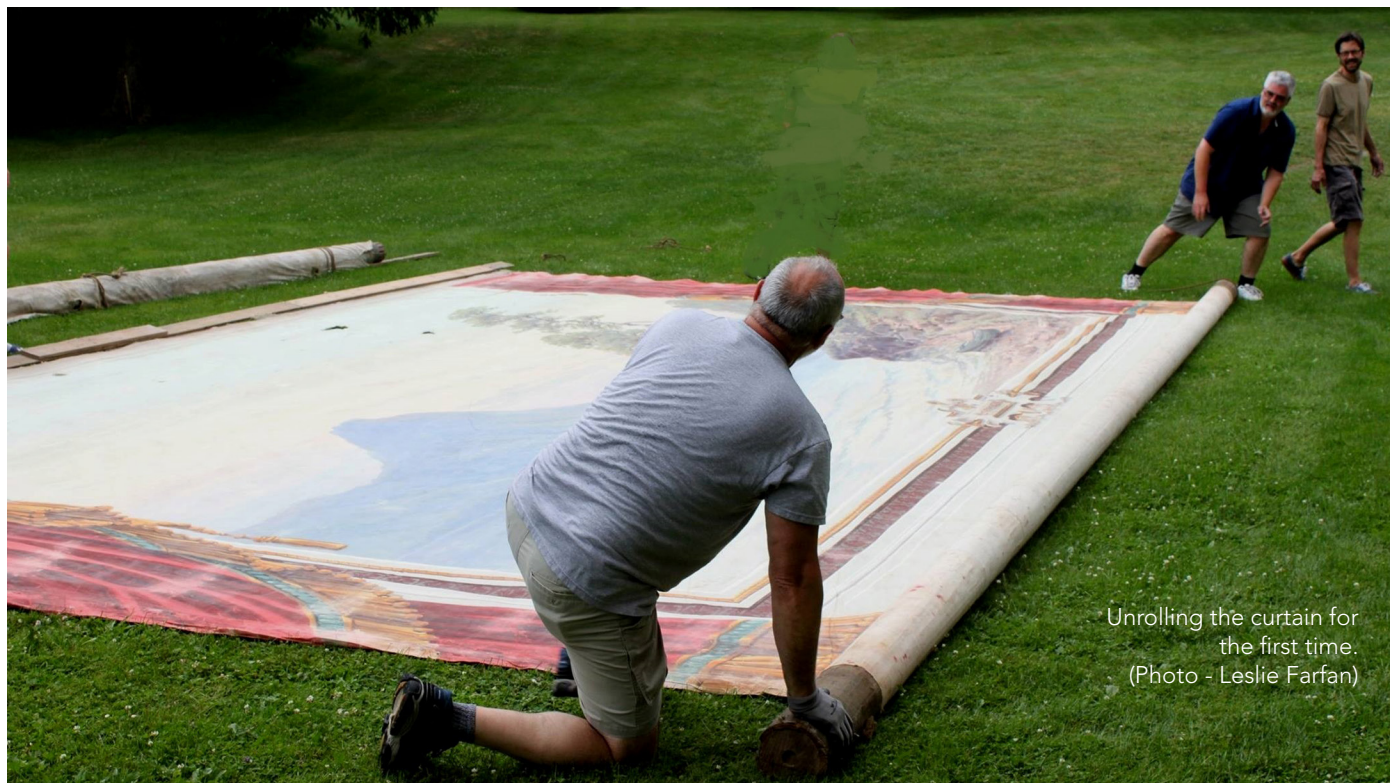
Unrolling the curtain for the first time.

After being measured and photographed by museum staff, the drape was carefully transported to the Colby-Curtis, where it is now stored in a proper climate-controlled environment, and where it begins a new chapter of its life. It is the hope of both the Haskell and the Stanstead Historical Society that a grant can be secured to have this magnificent piece professionally restored. Perhaps in the not-too-distant future, a suitable temporary venue can be found, where it can once again be enjoyed by all.