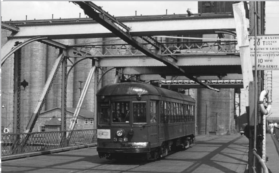
Crossing Black's Bridge over the Lachine Canal in June 1955.

Today, equipment from the M&SC, some has been fortunately preserved at Exporail, St. Constant/Delson, Quebec (104 & 611); Halton County Radial Railway Museum, Milton, Ontario (107); Shoreline Trolley Museum, East Haven, Connecticut (9) and Seashore Trolley Museum, Kennebunk, Maine (504, 610 & 621).