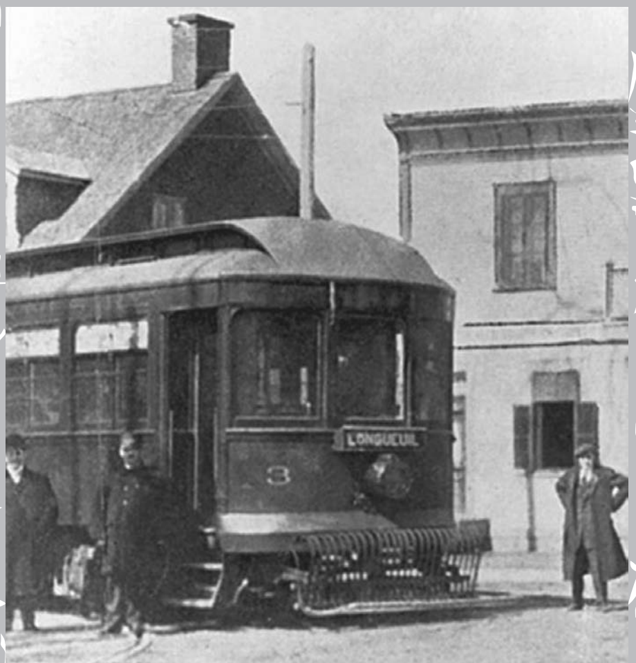
Corner of rue Guillaume and chemin Chambly.

With the acquisition of three new diesel locomotives in late 1951, electric service to Granby ceased on Saturday, November 24, 1951 and was replaced by diesel service the following