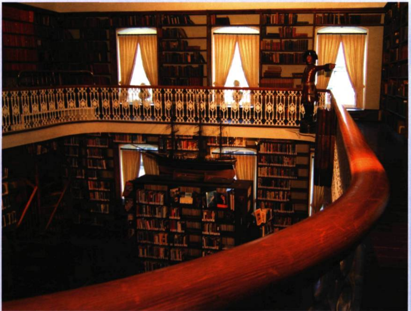
Library of the Literary and Historical Society of Quebec.

discussion and creation were their main preoccupations, the circle once hosted a talk on the medicinal effects of music. During the Société's first summer, a public contest was held with silver medals awarded to "la personne qui célébrera la naissance de sa glorieuse majesté George III, par une pièce de vers, Anglaise, Française ou Latine." Within less than a year, the society had folded.