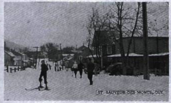
Saint-Sauveur, skiers on rue Principale, c. 1940.