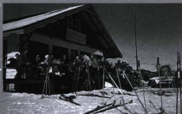
Bellevue Hill, the chalet, c. 1960.