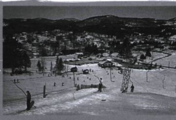
Bellevue Hill, Morin Heights, view from the J-Bar, c. 1960.