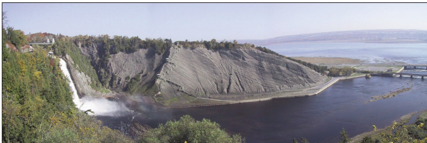
Figure 1. Panoramic view of the transition between the Precambrian gneisses, Ordovician carbonate and clastic foreland units, Montmorency Falls.

The one-day field trip entitled " Champlain Sea deltas and the St-Narcisse Moraine in the Portneuf and Mauricie regions of southern Québec: 3-D stratigraphic modeling and regional aquifer systems ", led by Michel Parent (GSC-Québec) and colleagues, will be of particular interest to quaternary- and hydro-geologists, and set the table for multiple groundwater-related special sessions. West of Québec, the Portneuf and Mauricie regions host some of the largest, most productive and widely used granular aquifers in southern Québec. Over the last 20 years, these aquifer systems have been extensively investigated in a series of studies ranging from 3-D stratigraphic models to groundwater flow modelling. The field trip will introduce participants to the regional groundwater systems of this part of the Laurentian foothills