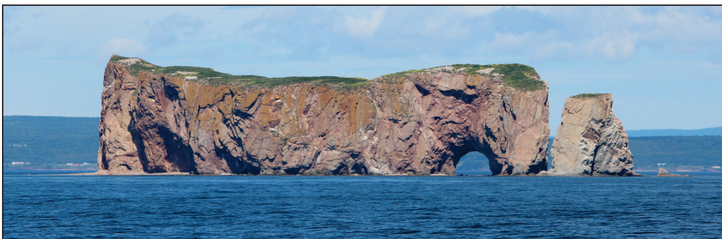
Figure 3. Rocher Percé, Quebec, part of the Percé UNESCO Global Geopark.

text ". Participants will visit the critical localities of the stratigraphy and the structural characteristics of the ophiolite complex, with a particular emphasis on pre- to syn-obduction structures and associated lithological variations in the crustal section of the ophiolite, and its overlying sedimentary cover. The trip will visit major lithological facies constituting the ophiolite complex: mantle, plutonic crust, boninitic lavas and dykes, chromitites, and hydrothermal systems. The excursion will examine pre-obduction synmagmatic structures that are attributed to fore-arc seafloor spreading, syn-obduction structures and facies (dynamothermal aureole and sole, intra-mantle granitoids, piggy-back basin sediment), as well as post-obduction overprinting structures related to both the Salinic and Acadian orogenies.