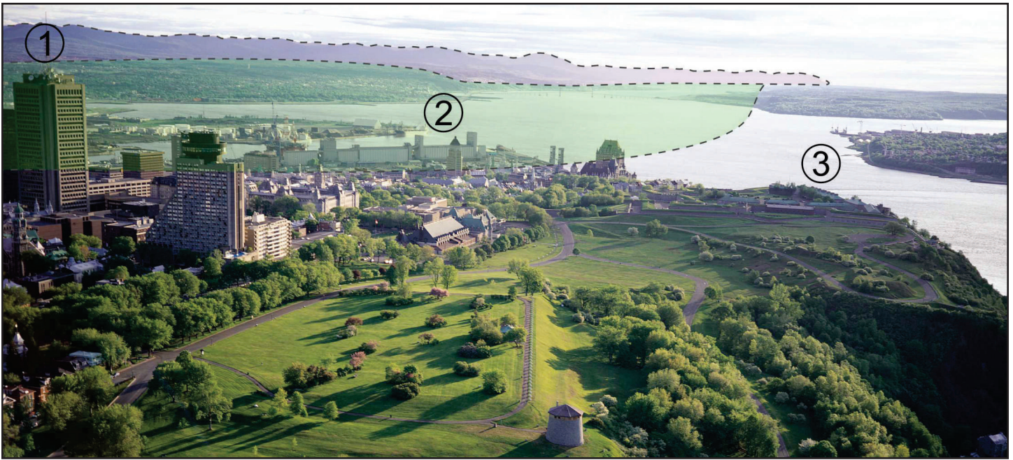
Figure 2. Panoramic view of the reliefs associated with the three geological provinces in the Quebec City area. 1- Canadian Shield/Grenville province; 2- St. Lawrence Lowlands/Platform; 3- Appalachians.

and present the stratigraphy and architecture of the Late Quaternary sediments hosting these aquifer systems, most notably the large paleo-deltas deposited by meltwater-fed rivers along the northern margin of the Champlain Sea and the glacio-fluvial/marine sediment bodies associated with the Saint-Narcisse Moraine and emplaced below the Champlain Sea limit in the St. Lawrence Valley.