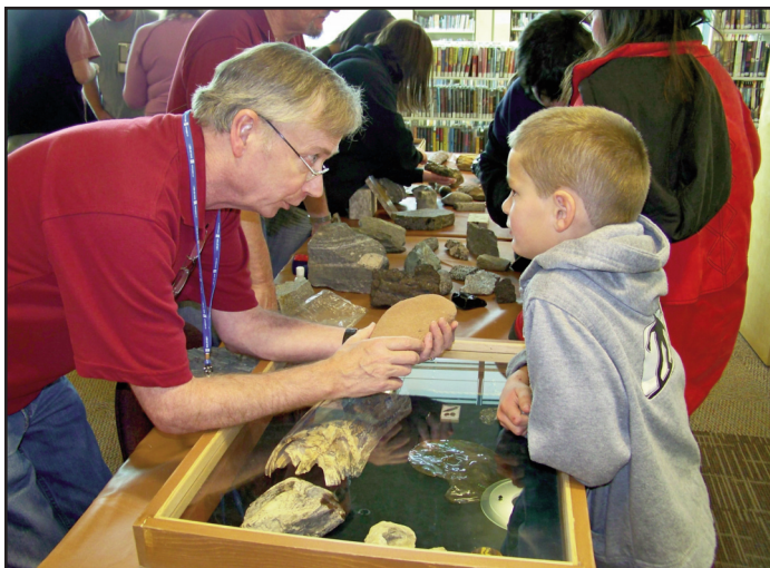
Figure 1. Interactions with earth scientists, focused on discussions of actual geological specimens, are key elements to the success of the Rock ‘n’ Fossil Road Show.

adapted by other research institutions interested in fun and effective public educational outreach programs.