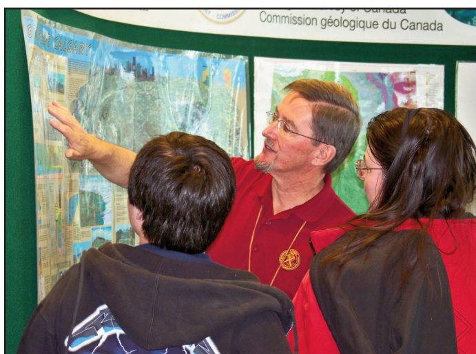
Figure 2. General interest posters, such as Geoscape Calgary (Poulton et al. 2002; Turner 2013), are an important part of the displays at each Rock ‘n’ Fossil Road Show.