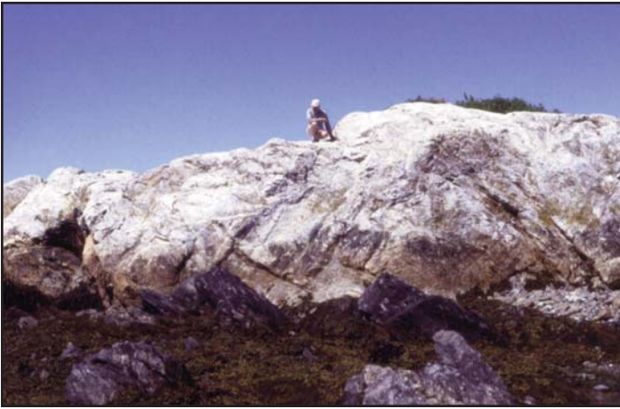
Figure 2. Massive quartzite of the Mesoproterozoic Thor-oughfare Formation.