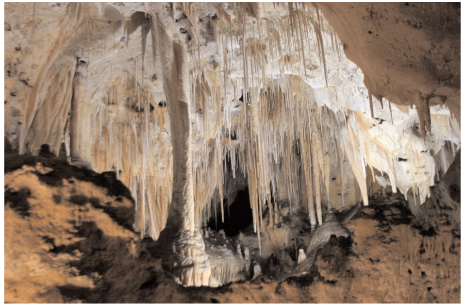
Figure 1. Speleothems in Carlsbad Caverns National Park, New Mexico, USA.

There are, however, many threats to geodiversity. There is a natural tendency to think of wildlife as being fragile and vulnerable and therefore in need of conservation, whereas rocks and mountains are seen as stable, static and much too prolific ever to be endangered. This is an oversimplifica-