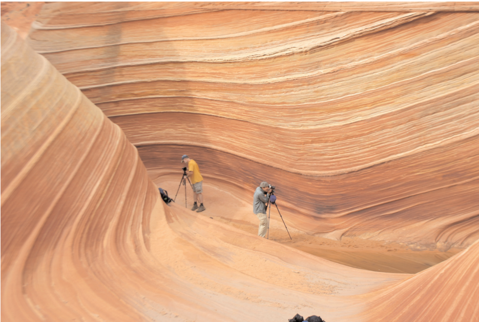
Figure 2. 'The Wave', water-eroded channels in the dune-bedded Jurassic Navajo Sandstone near the Utah–Arizona state border, USA. Access is restricted to a maximum of 20 visitors per day. Even so, they can get in each other's way!