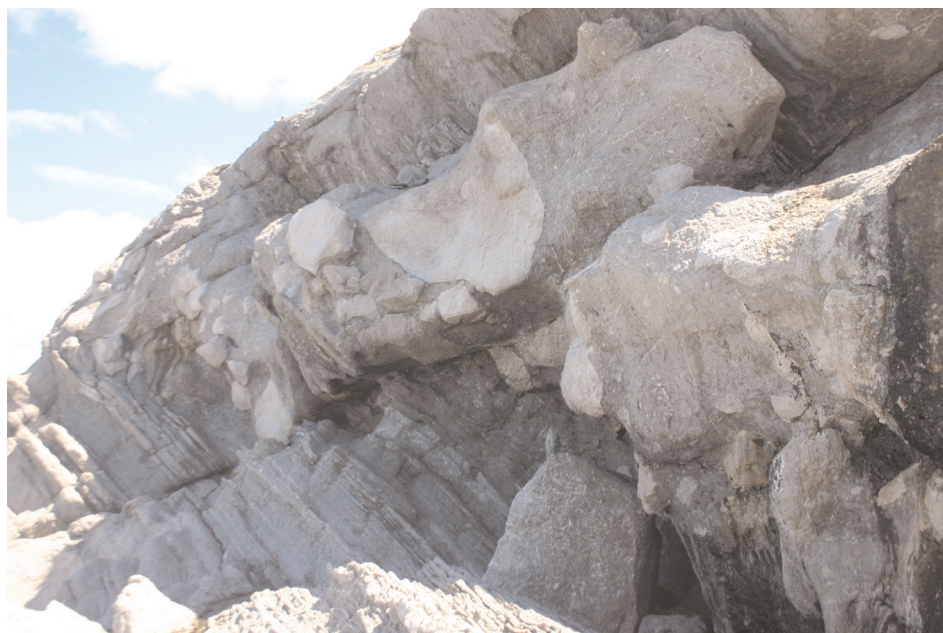
Figure 4. The Cow Head conglomerate, Cow Head, NL, Canada.

While some of the methods included in Table 2 apply to site conservation, others are more appropriate to the 'wider landscape'. Within nature conservation circles, there has been a growing dissatisfaction with an approach that relies solely on protected areas/sites to conserve nature. For example, Myers (2002, p. 54) argued that "setting aside a park in the overcrowded world of the early twenty-first century is like building a sandcastle on the seashore at a time when the tide is coming in deeper, stronger and faster than ever" . In other words, protected areas are becoming isolated from each other and vulnerable to