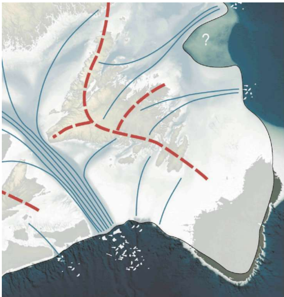
Figure 1. Conceptual model of the ice cover over Newfoundland during the last glacial maximum (modified from Shaw et al. 2006). Red dashed line indicates ice divide or ridge, thin blue lines represent generalized ice-flow trajectories.

sensitive to the number of measurements made.