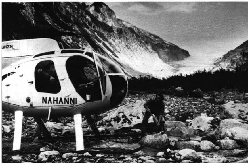
Figure 7 Regional geochemical surveys depend heavily on helicopter access to remote areas. Photograph shows a silt-sampling survey, northern Coast Mountains, 1978.

field geologists. Their work, such as that of Jim Fyles (Fig. 5) and his colleagues in southwestern British Columbia, was centred on mining districts and thus very useful in its own right. This valuable work provided significant by-products in the form of new interpretations of Cordilleran structure and stratigraphy, with their revelation of the nature and origin of the Kootenay Arc.