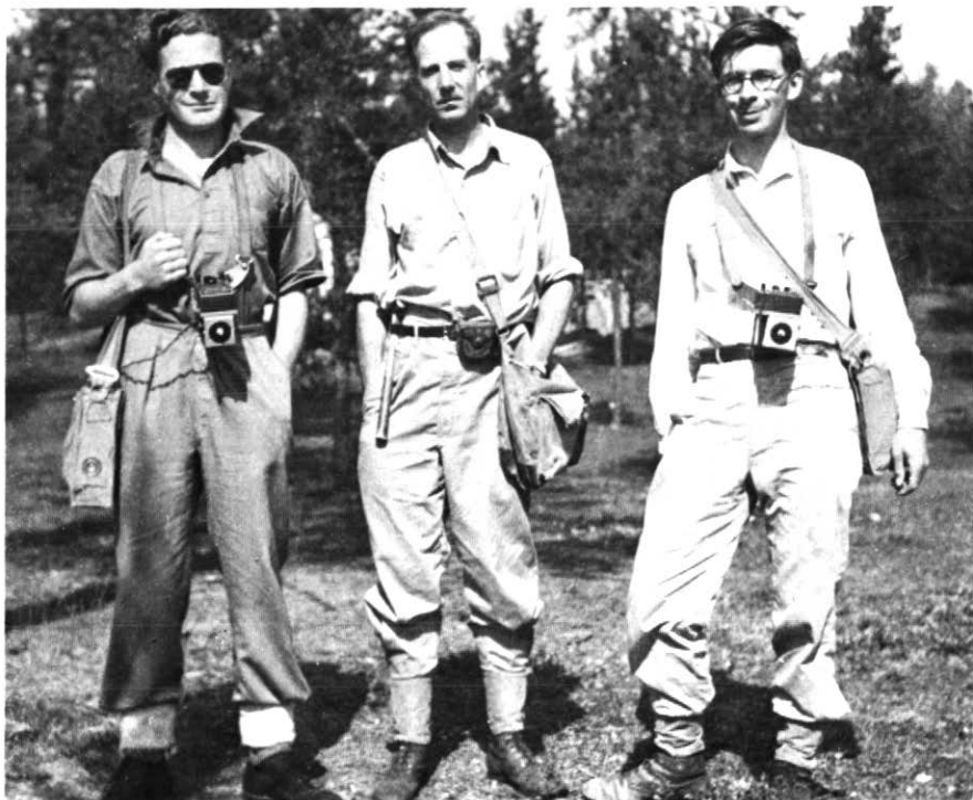
Figure 1 The first Scintillometer Surveys— June 1949, Nisto Property, Black Lake, Athabaska Area. Two Mark II spectrometers with ratemeters and controls suspended in front and separated

The initial attempt to measure radioactivity from aircraft was made on first approaching the Nicholson mine on June 18, 1949. Before landing, the pilot was instructed to fly over the main vein and in doing so a significant increase in radioactivity was noted with the instruments. A day