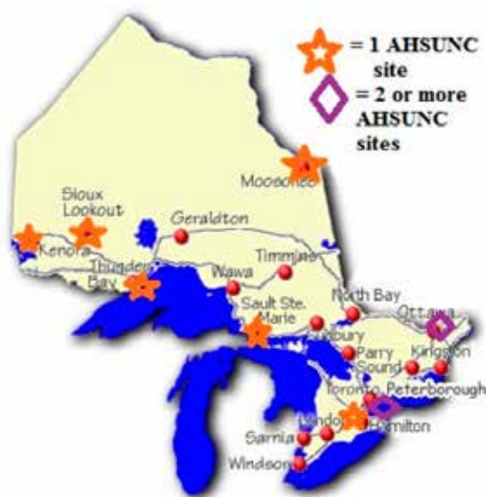
Figure 1: Map of Aboriginal Head Start Urban and Northern Communities Projects in Ontario

The Aboriginal population is the fastest growing population in Canada at 1.7 times faster than the non-Aboriginal rate (Cox, 2002; Hanselmann, 2001; Mendelson, 2006). The statistics also show that more than 62 percent of the Aboriginal identity population resides in off reserve areas like cities and rural towns (Mendelson, 2006). The Aboriginal population is younger than the overall Canadian population. According to Statistics Canada (2006), there is a total of 147,820 self-identified Aboriginal people in Ontario with 17,400 of those being children between 0 and 4 years of age in off reserve communities (Figure 2). As mentioned early, 560 Aboriginal children between 3 and 5 years old receive AHSUNC programming, which is approximately three percent of the off reserve self-identified Aboriginal children in Ontario.