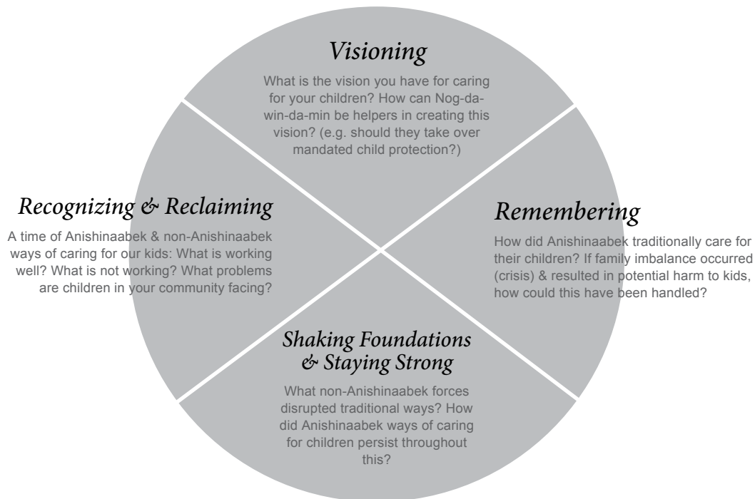
Figure 1: Nog-da-win-da-min, Anishinaabek Children & Minobimaadziwin

Elders also contributed their voices to the consultation process. To facilitate this support, Nog-da-win-da-min offered an honorarium to each Elder as a way to recognize and honour their knowledge of ceremony, prayer, and participation. Reflecting the diversity among the seven First Nations, some focus groups requested and arranged for an Elder's assistance, while others did not deem it necessary.