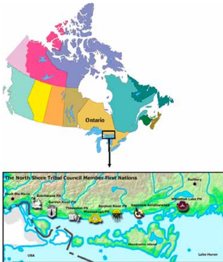
Map 1: Location of the North Shore Tribal Council First Nations

payments to member First Nations for delivery of community support services (i.e., primary child welfare prevention).