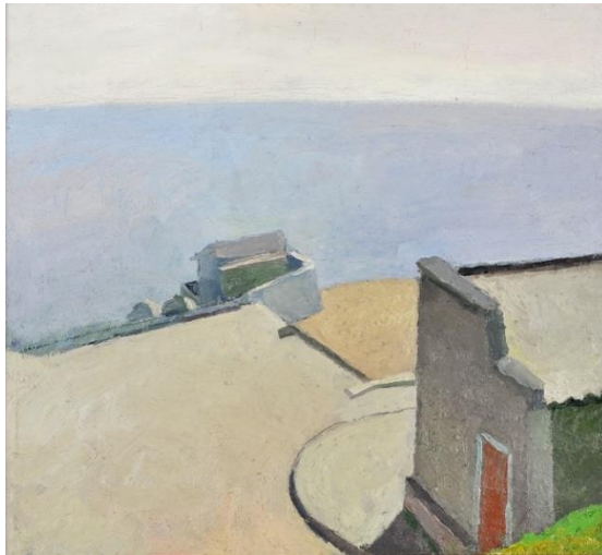
Figure 1. Iurii Iehorov, "Poluden'" ("Noon," 1986), reproduced with permission from the "Metafizyka. Ostriv" exhibition organizers, the Mynule. Maibutnie. Mystetstvo project ( pastfutureart.org ).

other, different senses that radiate through it. Seizing on the blinding hot summer noonday sun as a trope, they highlight the strange timeless feeling it generates, the simplified lines and shapes, and the rich, if also faded, colours. The other word in the exhibition title, "island," was meant to attract our attention to the city's symbolic place between two seemingly endless expanses—of the sea and the steppe that are simultaneously linkages essential for its identity and markers of its symbolic self-sufficiency and even self-centredness. 3 The works in the exhibition were drawn from the legacy of Odesa's nonconformist painters of the 1960s–70s, notably Valerii Basanets', Iurii Bozhko, and Liudmyla Iastreba. A painting by Iurii Iehorov, arguably the best-known Odesa painter of those decades and a mentor of the nonconformists, titled "Poluden'" ("Noon"), is an excellent example of this trend, with its urban seaside landscape reduced to a minimum of details and overpowered by intense sunlight.