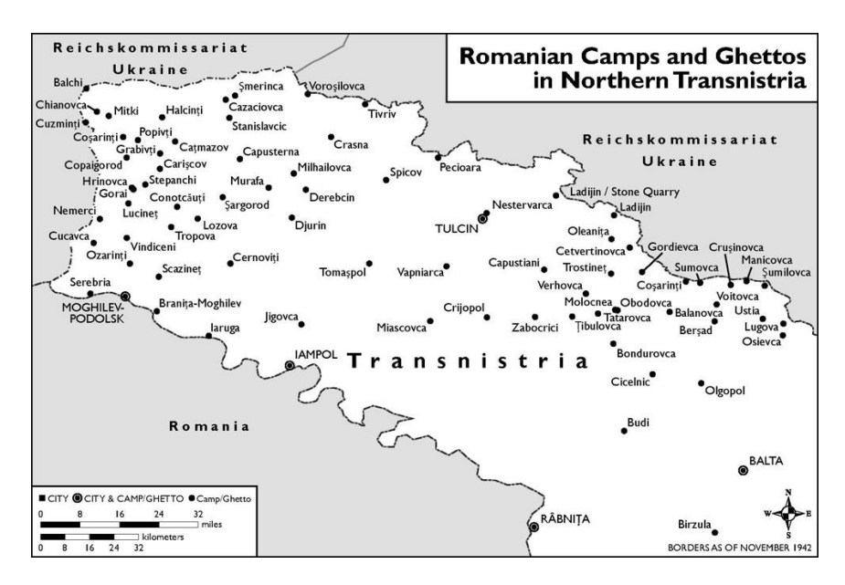
Figure 2. Map of Romanian camps and ghettos in Northern Transnistria. Courtesy of the United States Holocaust Memorial Museum.

In Râbniţa, where the condition of deportees passing through was described above in such dire terms, a report from several months later, dated 19 April 1942, presented the situation of the 1,471 Jews in the town's ghetto in much more positive terms. Of the 293 men, 609 women, and 569 children, 635 were deemed unable to work, but the ghetto had a public kitchen that fed a single meal each day to 230 people, as well as a medical dispensary and a "very well-supplied" pharmacy. There were seventeen workshops in the ghetto employing 130 Jews, who were doing work mainly for the population of the city. While some employers of this forced labour had not paid labourers all of the money due to them, still, the report concluded, "the ghetto is in satisfactory condition, the houses whitewashed, sanitary conditions almost sufficient."