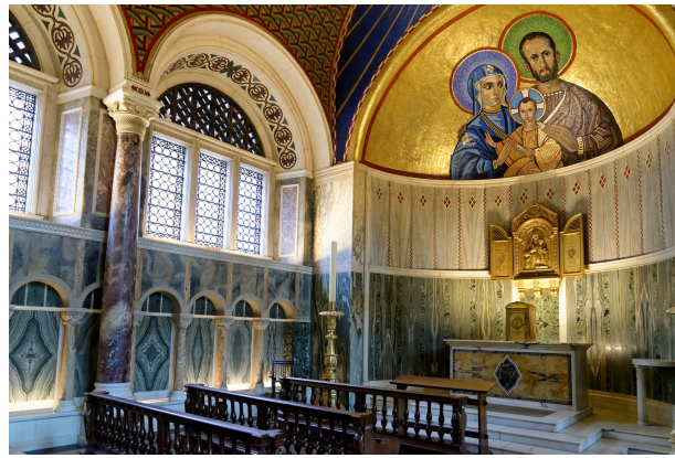
Picture 3: The Chapel of St. Joseph in Westminster Cathedral

“After ten minutes in the cathedral, a range of ideas that would have been inconceivable outside began to assume an air of reasonableness. Under the influence of the marble, the mosaics, the darkness and the incense, it seemed entirely probable that Jesus was the son of God and had walked across the Sea of Galilee. In the presence of alabaster statues of the Virgin Mary set against rhythms of red, green and blue marble, it was no longer surprising to think that an angel might at any moment choose to descend through the layers of dense London cumulus, enter through a Window in the nave, blow a golden trumpet and make an announcement in Latin about a forthcoming celestial event. Concepts that would have sounded demented forty metres away, [...] [that is, outside the cathedral] had succeeded – through a work of architecture – in acquiring supreme significance and majesty” (de Botton 2006: 109-111).