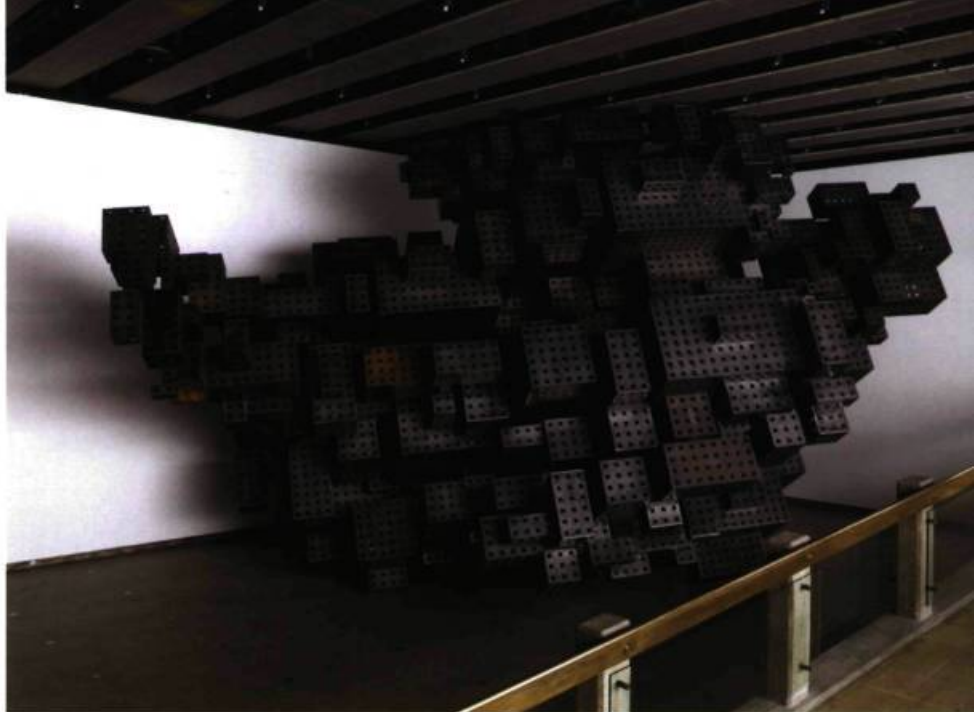
Anthony Gormley, Space Station , 2007. Corten mild steel plate. Courtesy of the artist and Jay Jopling/White Cube, London. Photo: © Stephen White

A downstairs gallery contains row upon row of concrete blocks. These blocks were scaled to the body size of actual citizens of the Swedish city of Malmö. Allotment II (1996) as the piece is titled is like a city of built forms, each the size of a human body, generalized into geometry. There are dark openings, orifices of the body; a mouth, two ears, an anus or genitals, again rectangles or cubes.