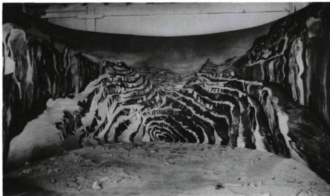
Kevin Kelly, A Reconstructed Landscape , 1989. Diorama, oil on linen; 2,7 x 9,1 x 9,1 m.

"Nihilism stands at the door : whence comes this uncanniest of all guests." Nietzsche