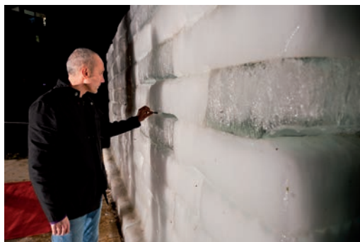
JANEZ JANŠA, THE WAITING WALL , NOVO MESTO, SLOVENIA, 2011.