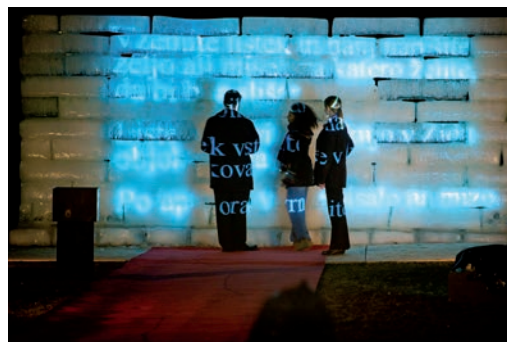
JANEZ JANŠA, THE WAITING WALL , NOVO MESTO, SLOVENIA, 2011.